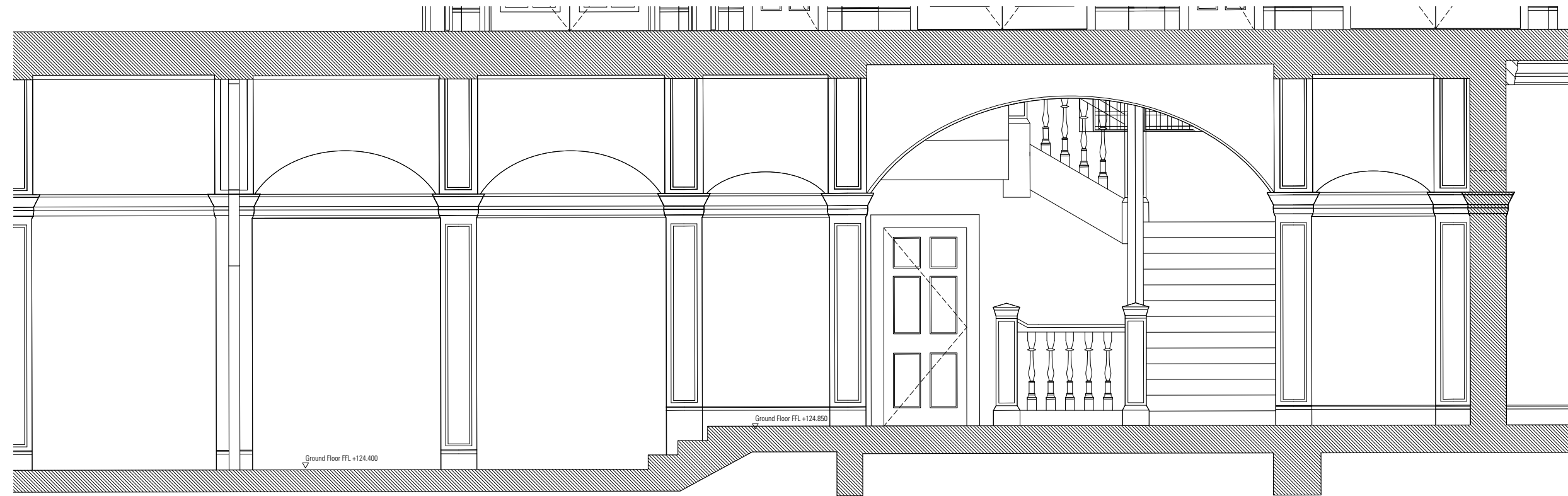
B Internal Elevation B Scale 1:25 (A1 - 1:50 (A3))

C01 26.07.2013 timber balustrade reinstated