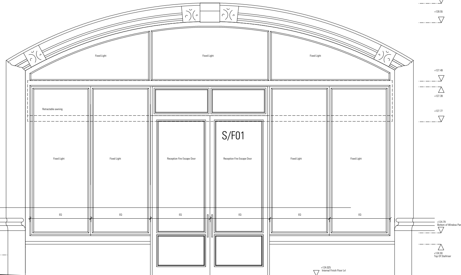
03 Proposed Shopfront Elevation Bay 3 1:200(A1)