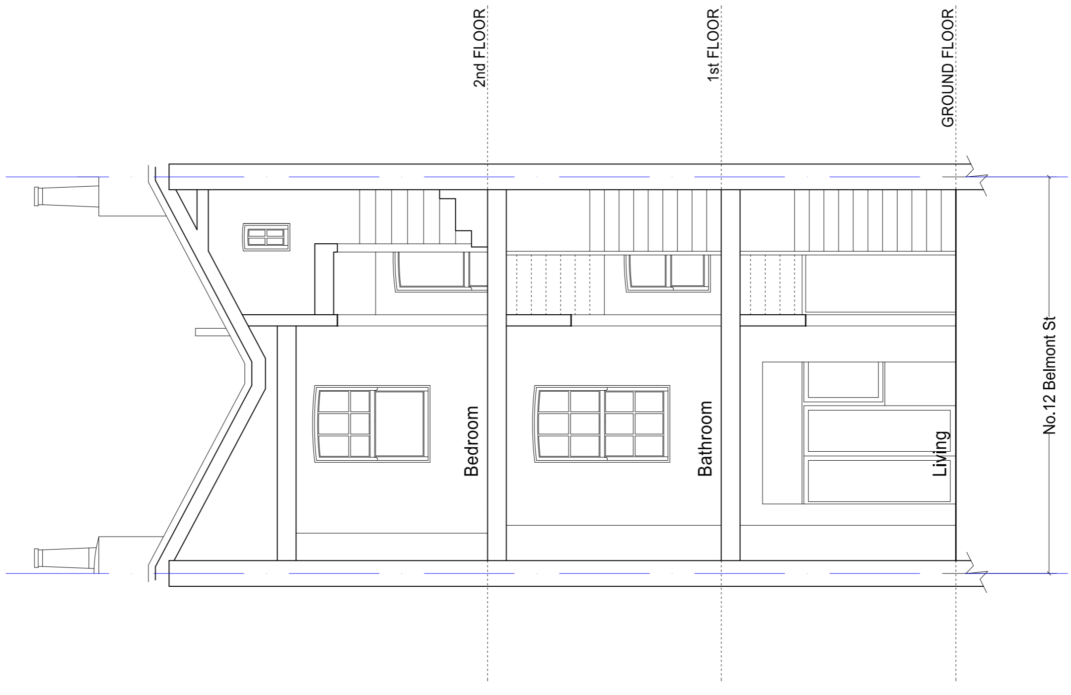
EXISTING SECTION CC'