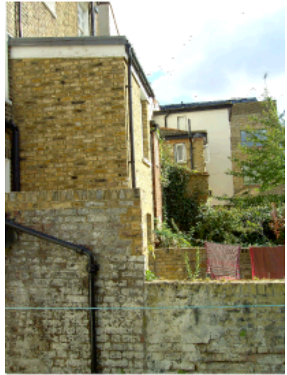
Ph5 - Rear elevation looking towards no.s 55 and 57