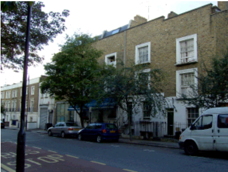
Ph6 -Front elevation looking towards no.s 55 and 57 - showing mansard roof extensions

Suite T, 25 Horsell Road, Highbury, London N5 1XL T 020 7700 2916 F 020 7700 2933 E g@glaad.co.uk