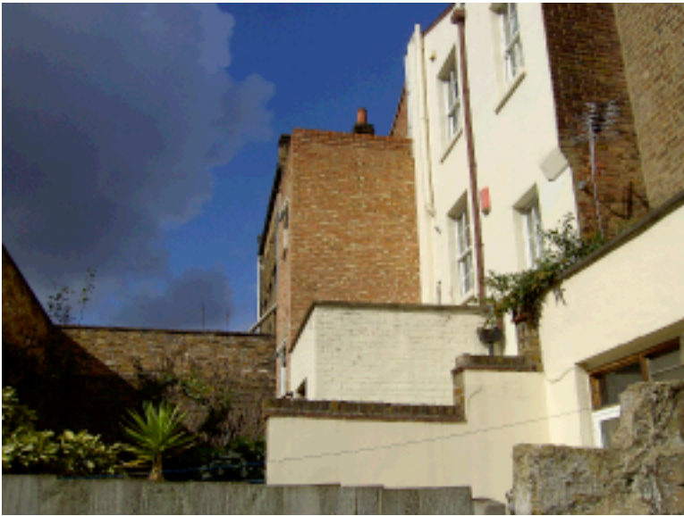
Ph4 - Rear elevation looking towards no.s 71 and 73