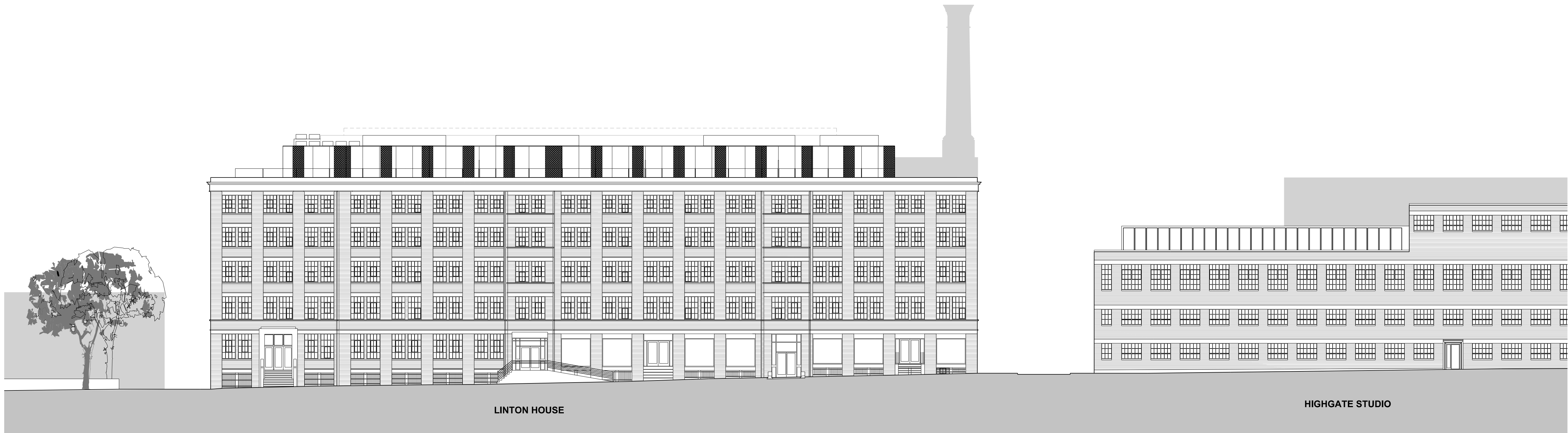
2 East streetscape elevation as proposed 152_320 Scale 1:200 @ A1