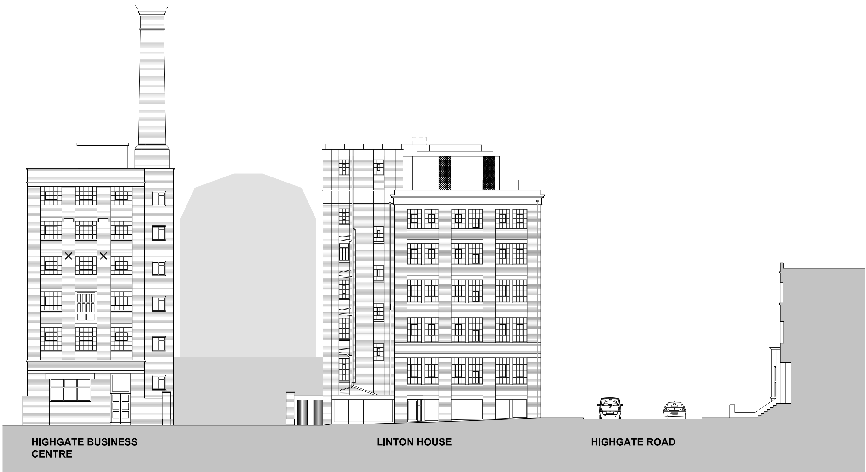
1 South streetscape elevation as proposed 152_320 Scale 1:200 @ A1