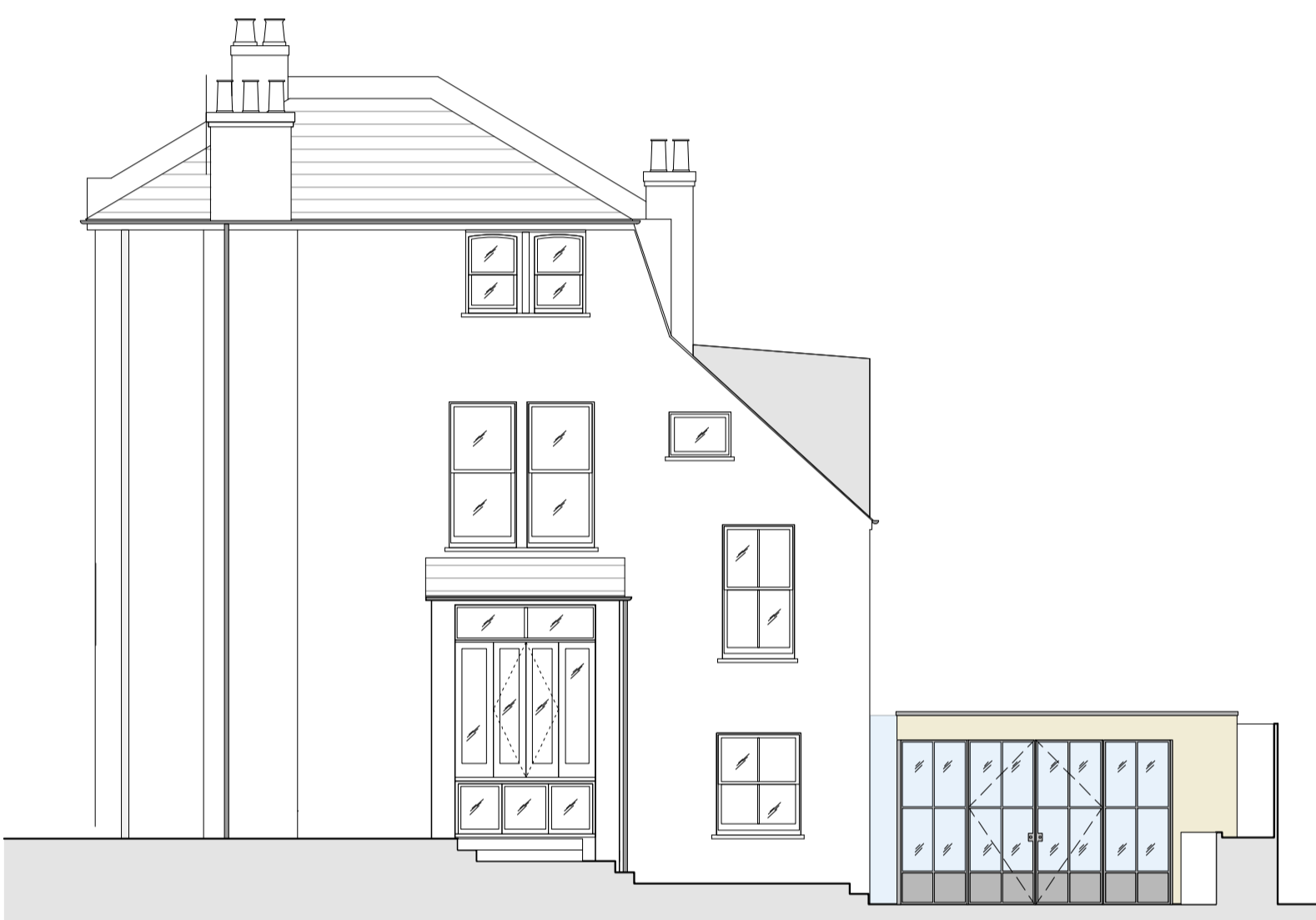
3 SIDE ELEVATION EXISTING PERMISSION Scale: 1:100