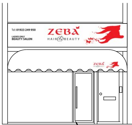
polyester powder-coated aluminium shopfront