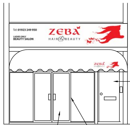
glass door polyester powder-coated aluminium shop front