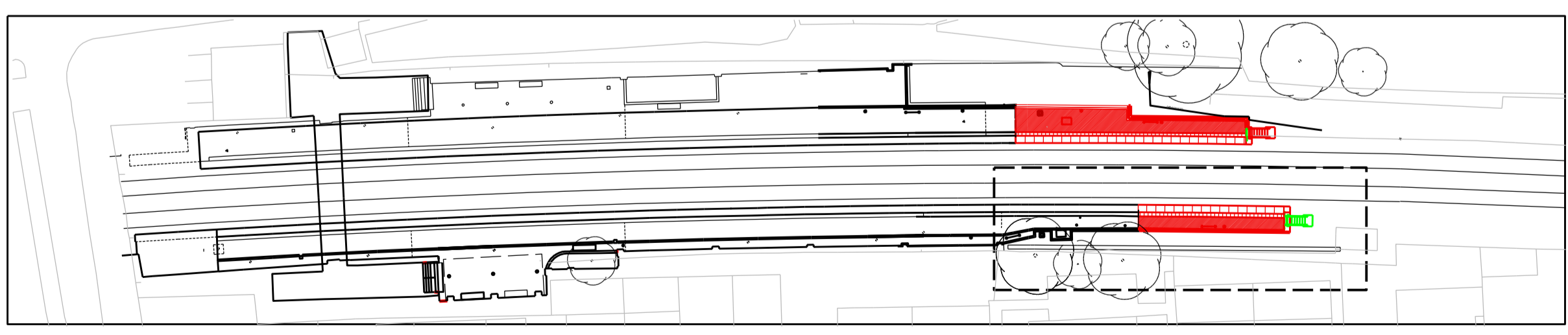
KEY PLAN - NTS

NOTES - LEGEND: — PROPOSED CONSTRUCTION — EXISTING CONSTRUCTION RETAINED NEW SIGNAGE AND LIGHTING COLUMN POSITIONS INDICATIVE ONLY GENERAL NOTES: 1. ALL DIMENSIONS ARE IN MILLIMETERS UNLESS STATED OTHERWISE. 2. DRAWINGS ARE BASED ON ORDNANCE SURVEY LAND TILES AND ENHANCED WITH TOPOGRAPHICAL SURVEY DATA COLLECTED VIA HALCROW AS PART OF THE GRIP 4 LOCIP DESIGN PROCESS. 3. PROPOSED WORKS ARE BASED UPON THE HALCROW GROUP LTD GRIP 3 DESIGN REPORT FOR THE NORTH LONDON LINE. REFER TO DOCUMENT NUMBER LCNP-HAG-EN00-01_AM-W-0001 4. DETAILS OF ELEVATIONS, HEIGHTS AND ARRANGEMENT BASED ON NLRIIP DRAWINGS SUPPLIED BY HALCROW. IT IS RECOMMENDED THAT THE DESIGN INFORMATION CONTAINED IN THIS DRAWING IS FURTHER VALIDATED ON SITE.