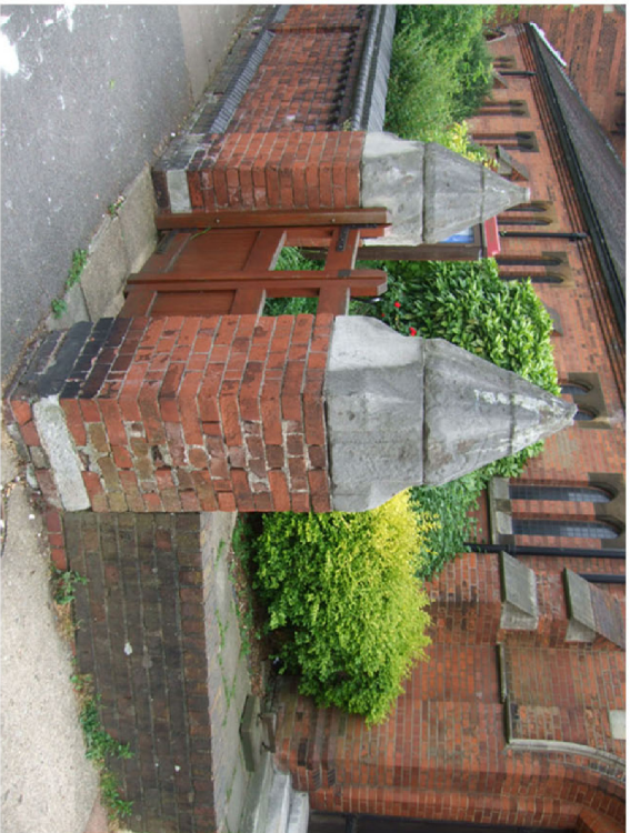
EXISTING GATE AND PIERS: OUTER FACE