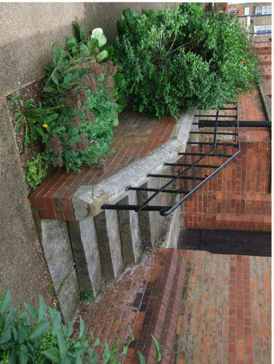
EXISTING HANDRAIL TO ADJACENT DOOR OPENING