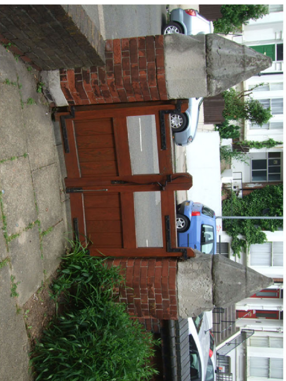
EXISTING GATE AND PIERS: INNER FACE