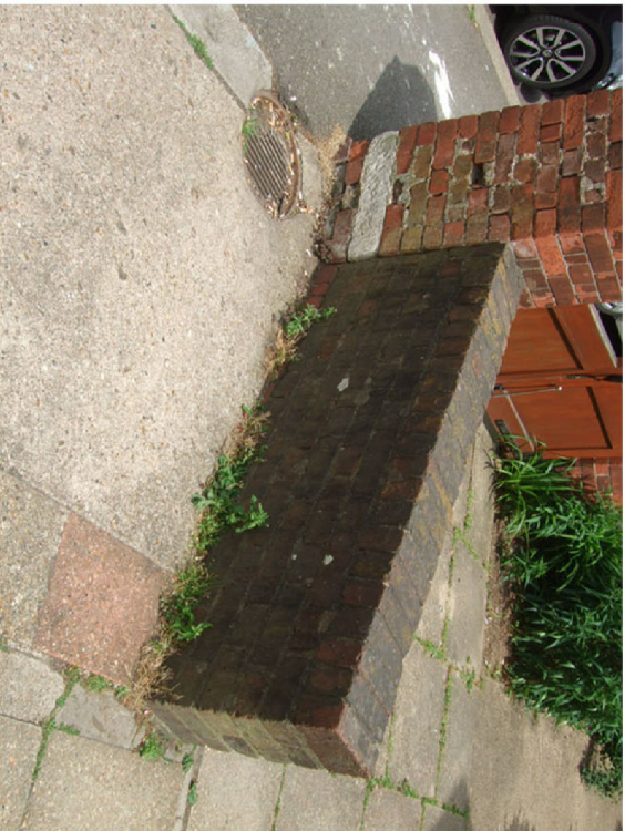
EXISTING BOUNDARY WALL TO BE REMOVED