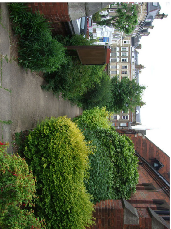
EXISTING PATH LOOKING EAST