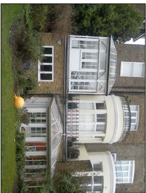
SCALE N/A@A3 SITE PHOTO: VIEW FROM GARDEN EX-01