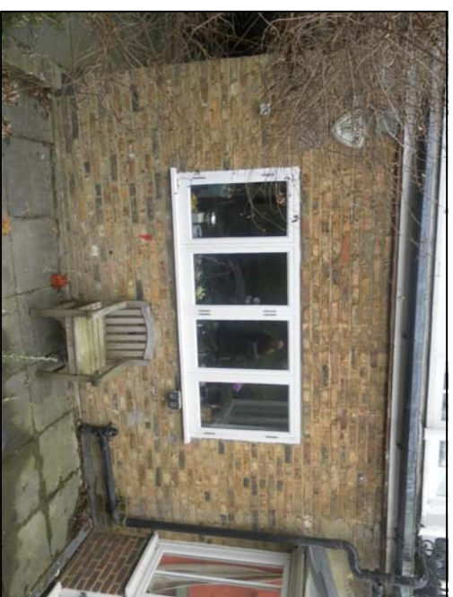
SCALE N/A@A3 SITE PHOTO: EXISTING WINDOWS EX-01