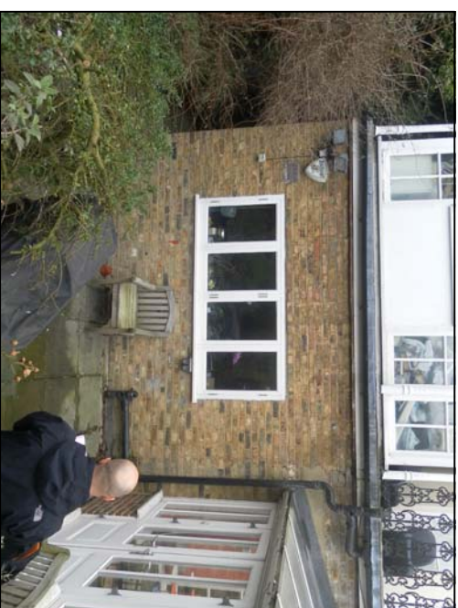
SCALE N/A@A3 SITE PHOTO: EXISTING REAR ELEVATION EX-01