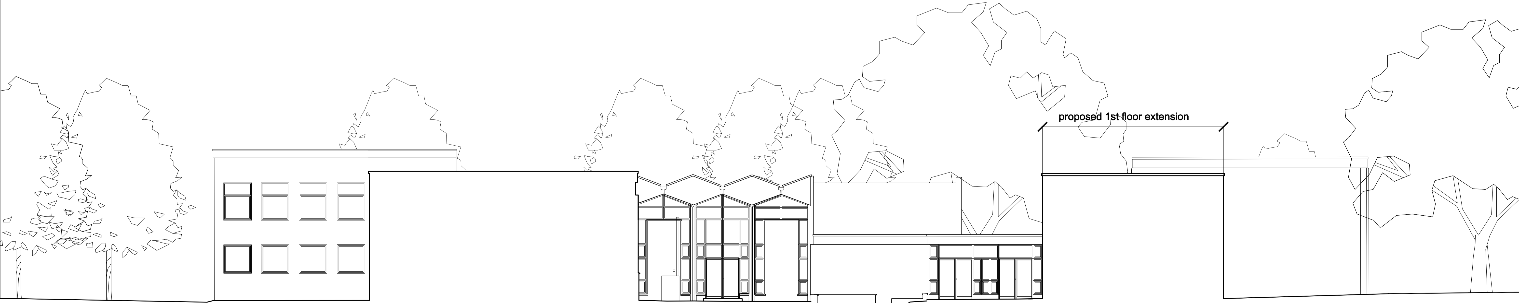
Proposed courtyard (north east) elevation