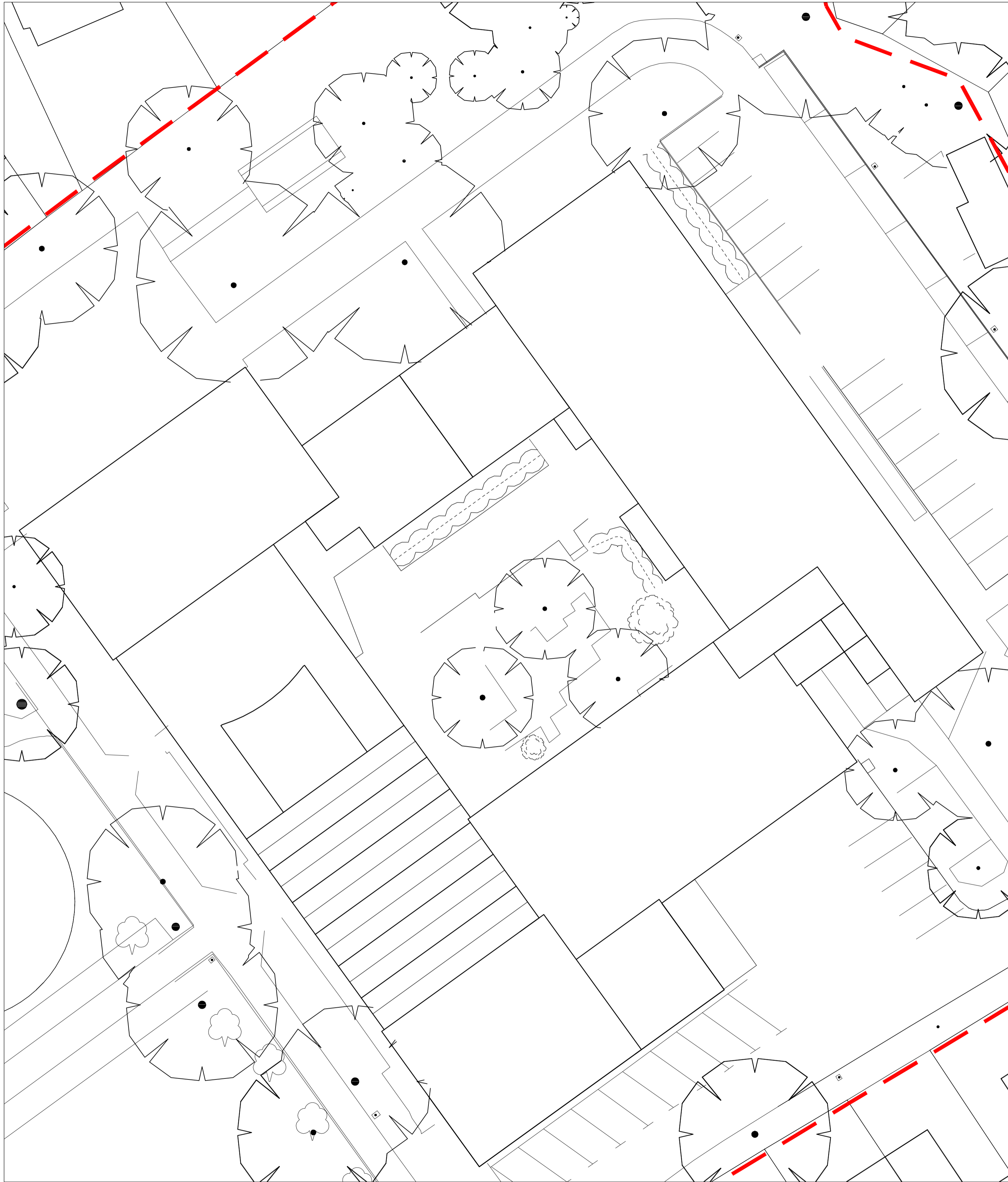
Existing roof plan 1:200