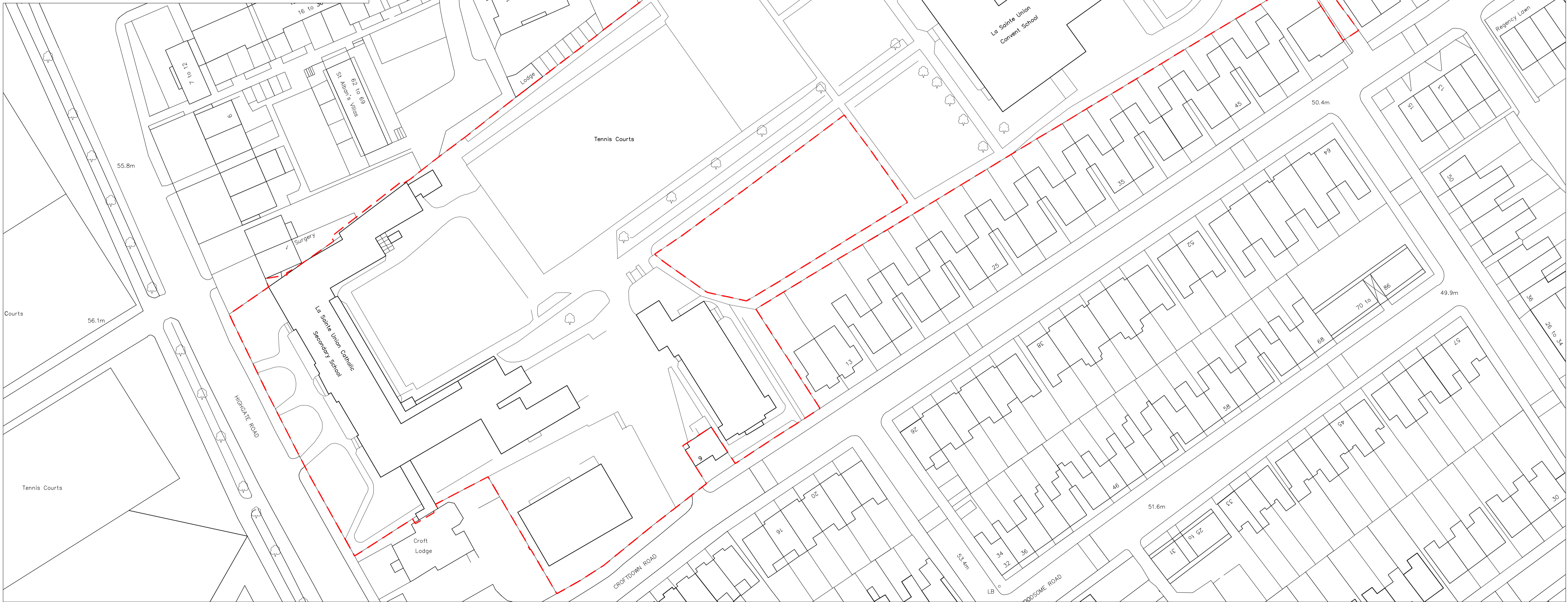
Existing site plan 1:500

Revisions A Amended boundary line. 19/08/13