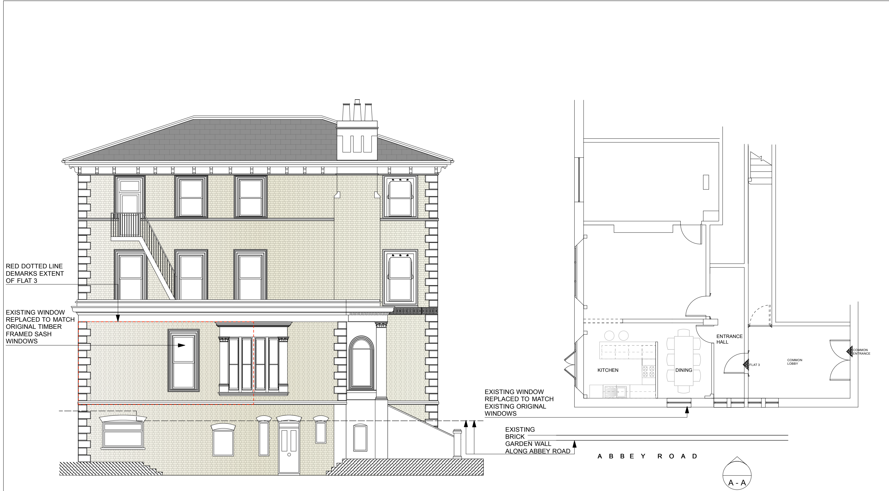
PROPOSED ELEVATION ABBEY ROAD