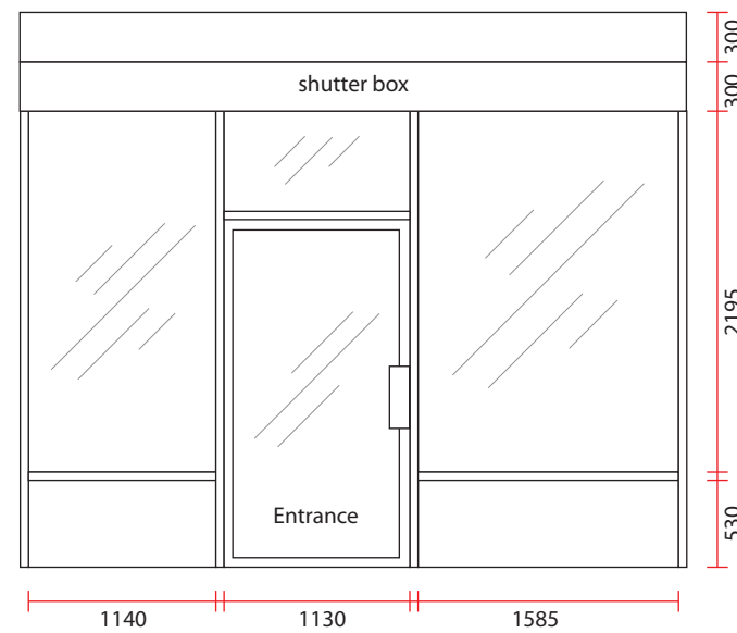
01: Prior to Works Part Elevation 1:50