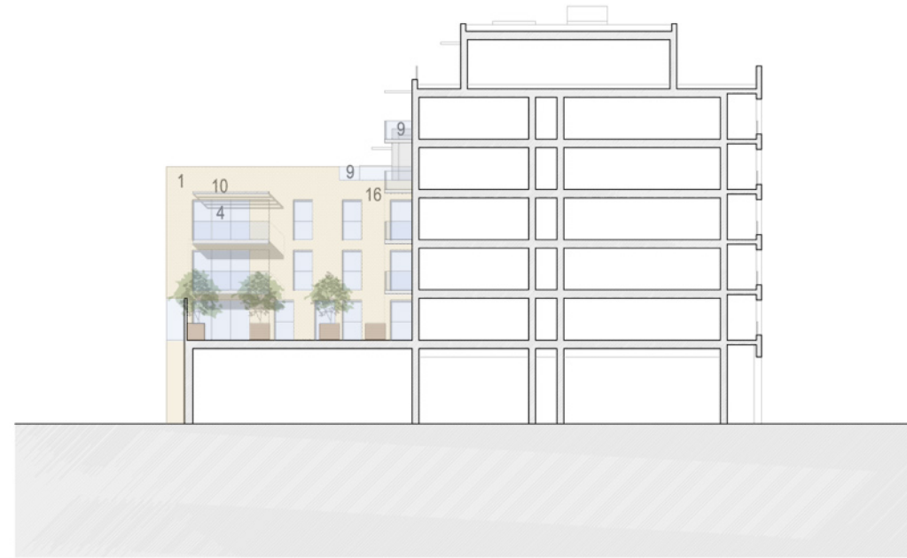
Proposed East Elevation facing roof garden