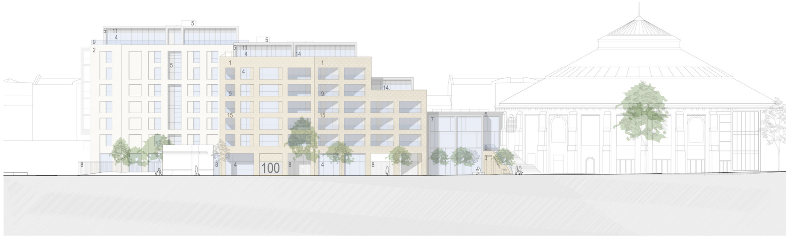
Proposed North Elevation - Chalk Farm Road