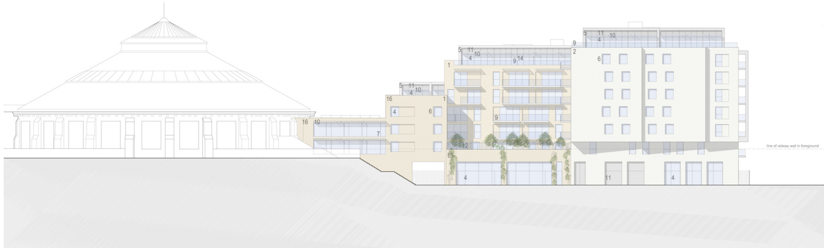
Proposed South Elevation - Railway Line