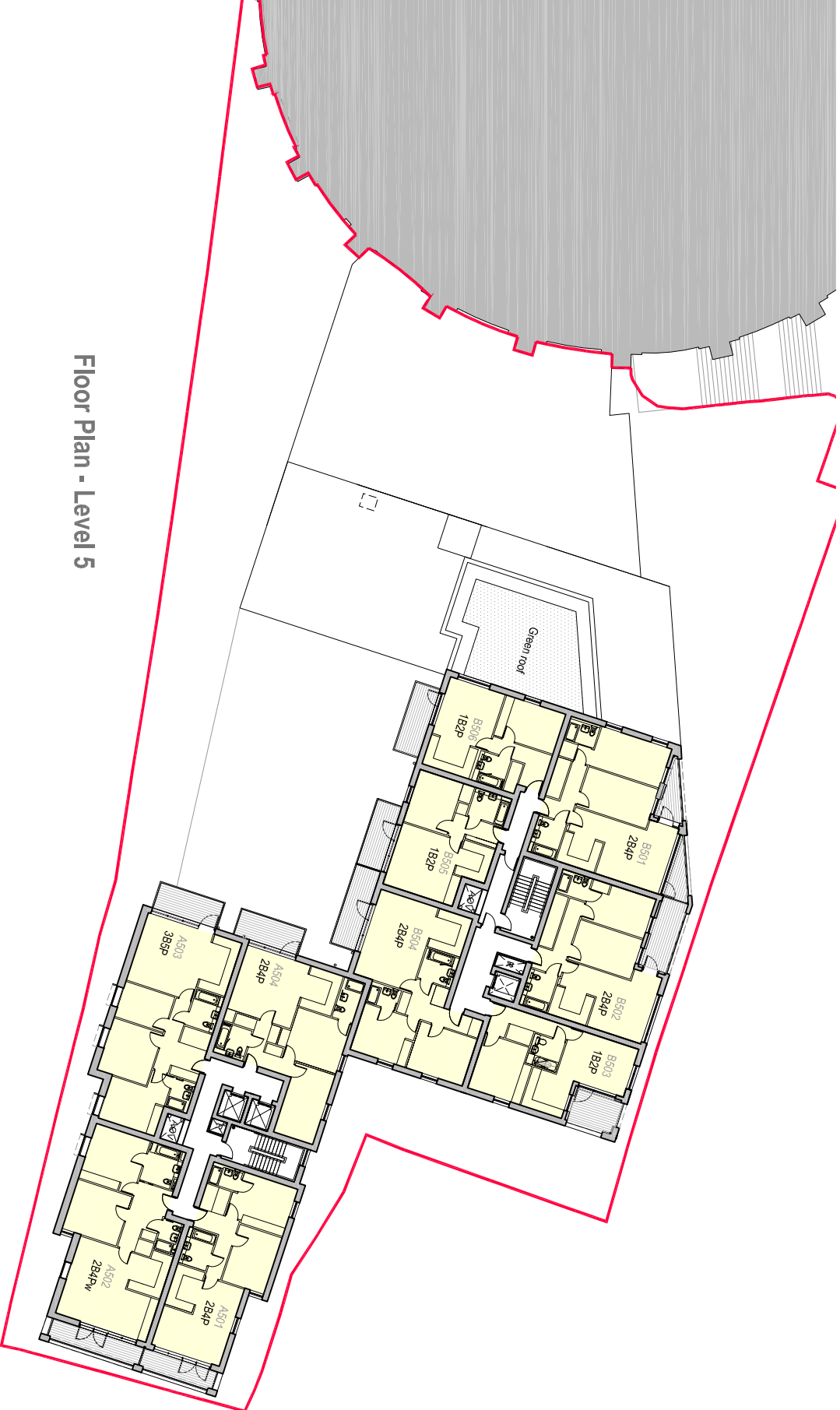
Floor Plan - Level 5