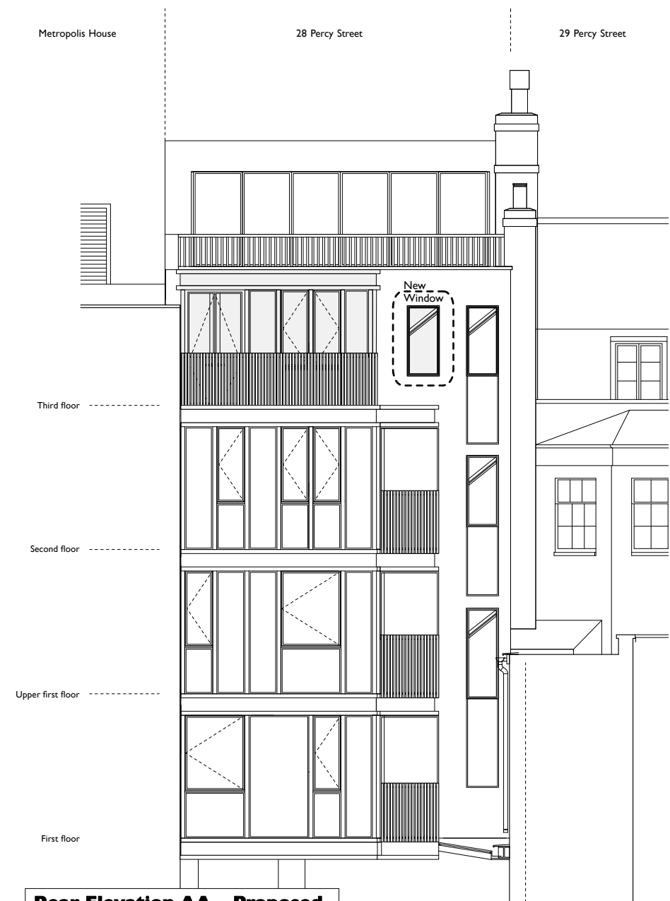
Rear Elevation AA - Proposed

Translucent glazing to be used to flank elevation for privacy and to prevent overlooking