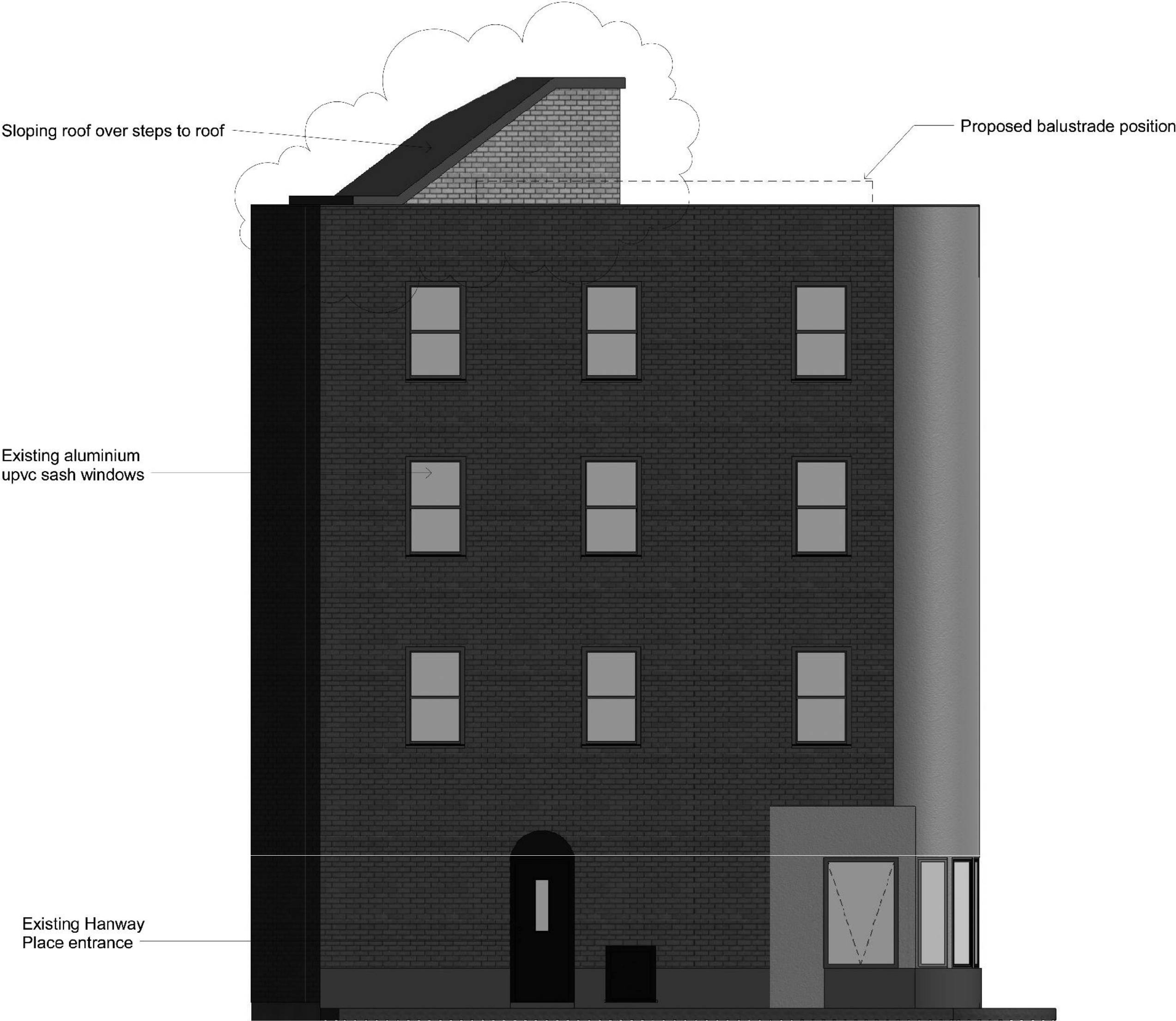
1 Hanway Place Elevation 1 : 50

NOTE: PRIVACY SCREEN TO BE APPLIED TO WEST ELEVATION