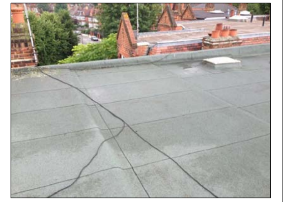
Photos Roof as Existing