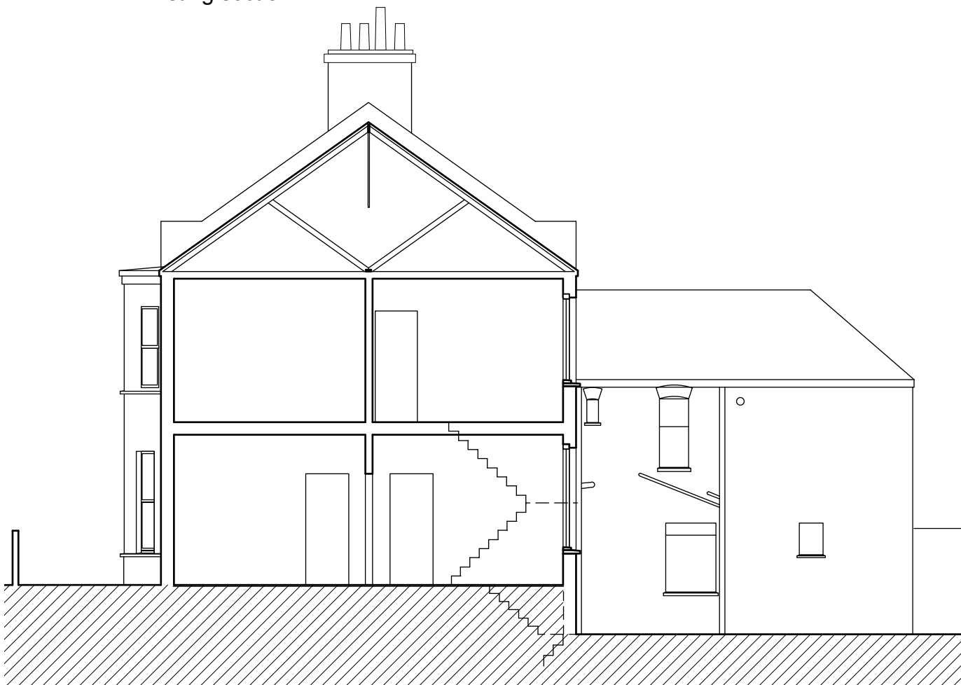
Existing section B