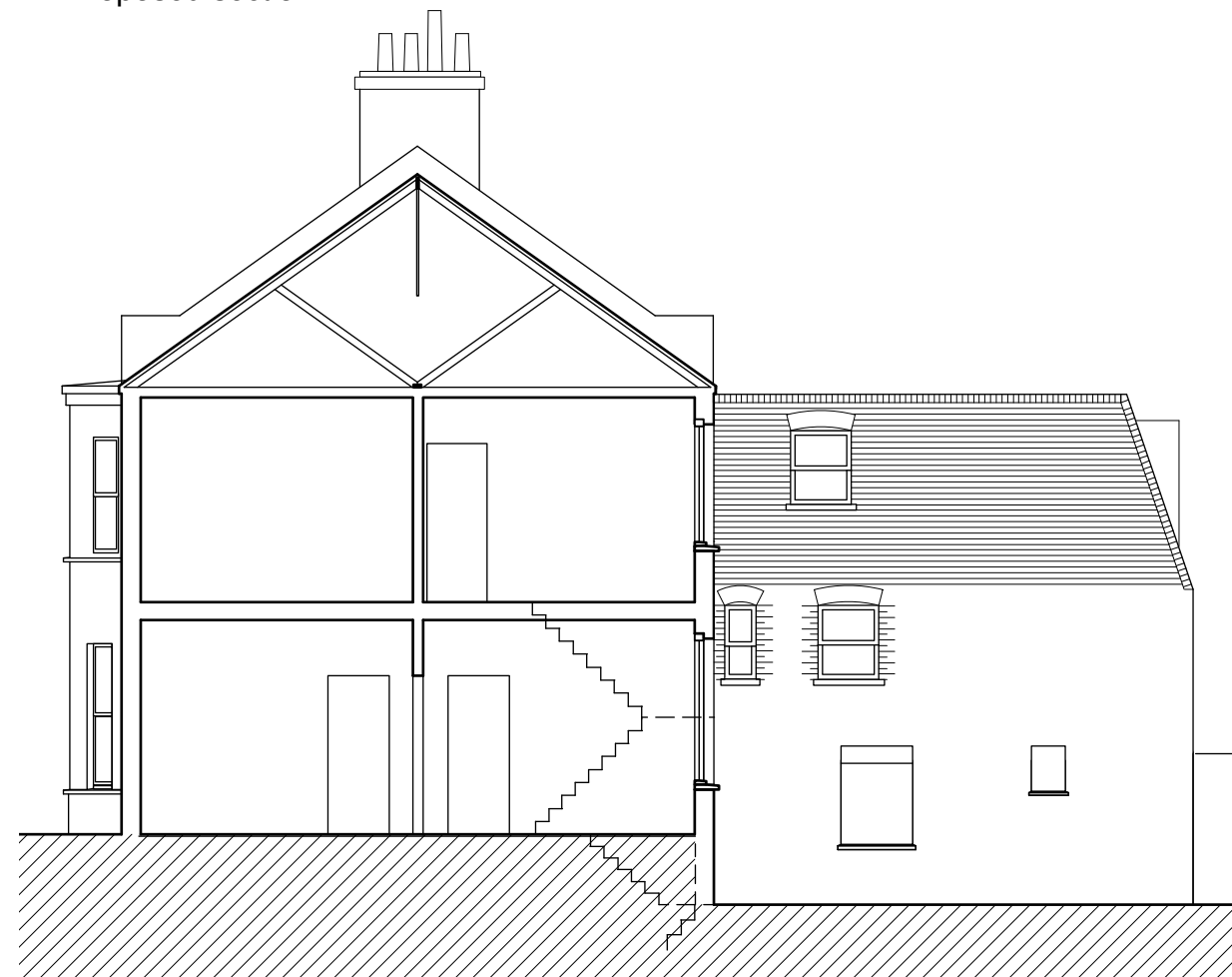
Proposed section B