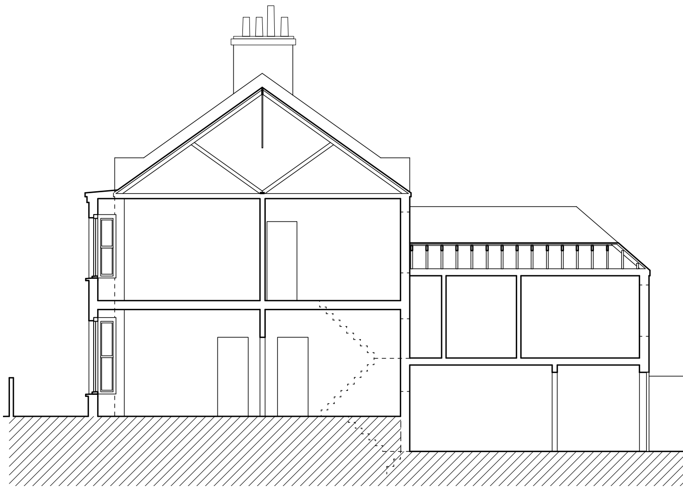
Existing section A