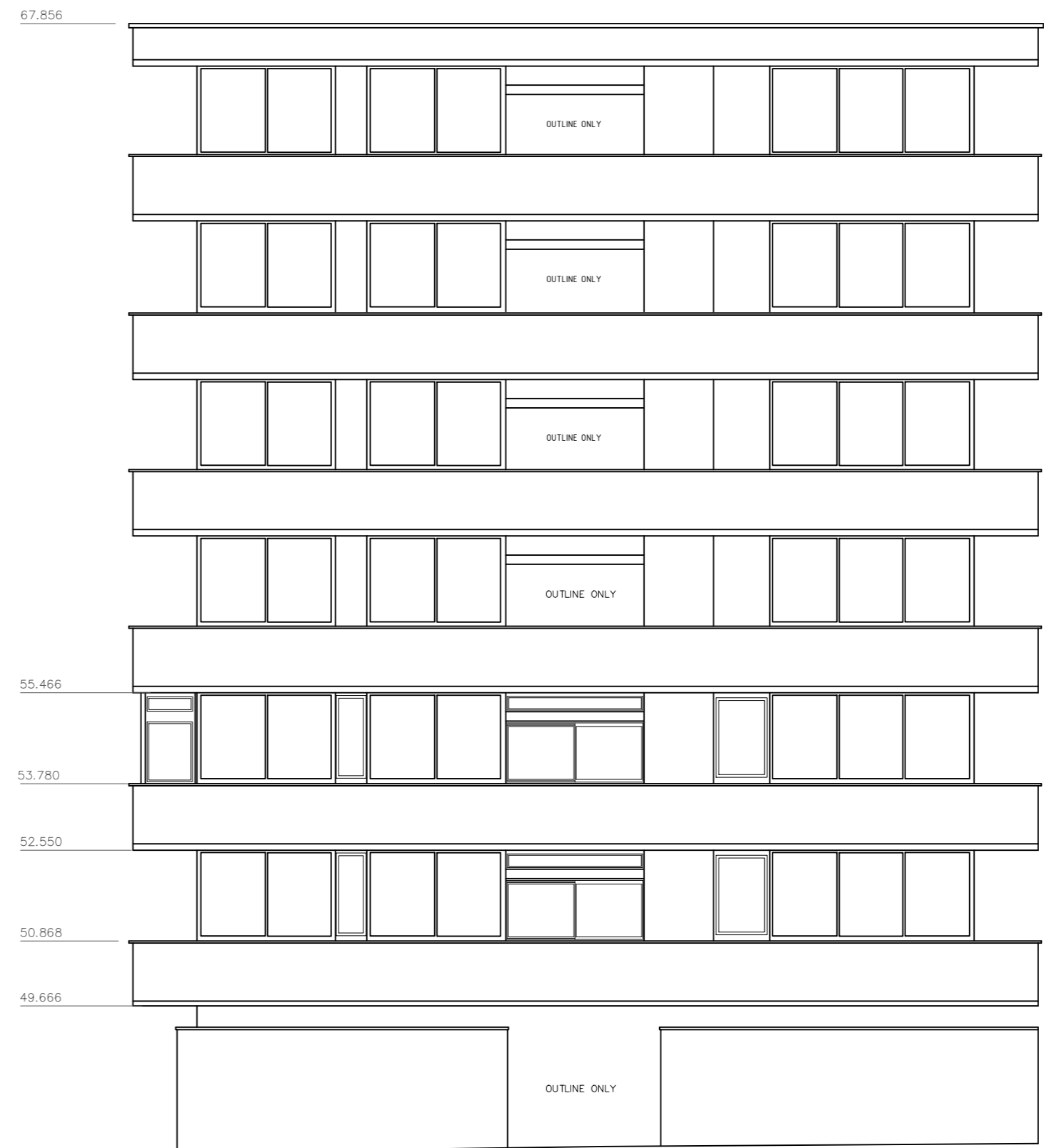
EAST ELEVATION DATUM 45.00m