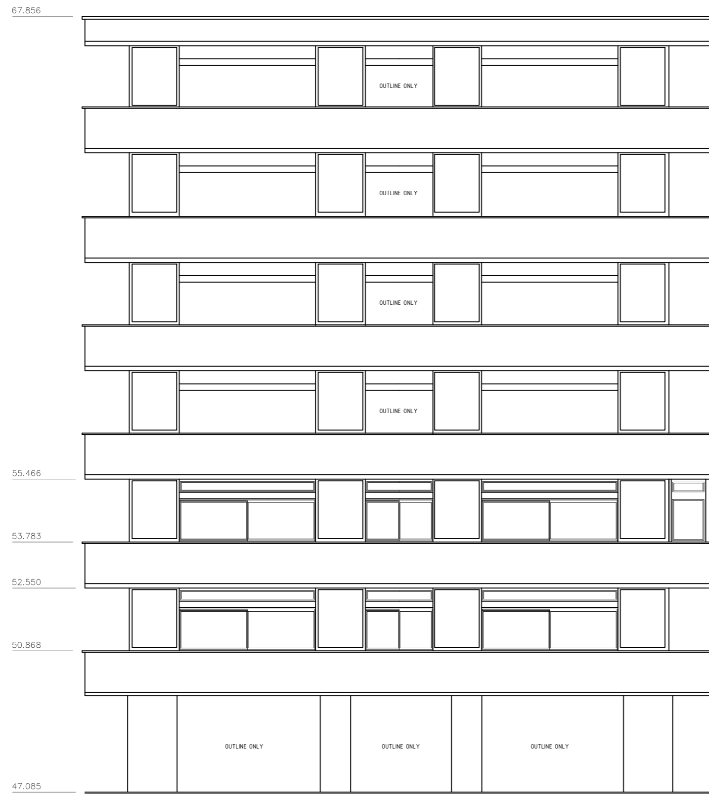
WEST ELEVATION DATUM 45.00m