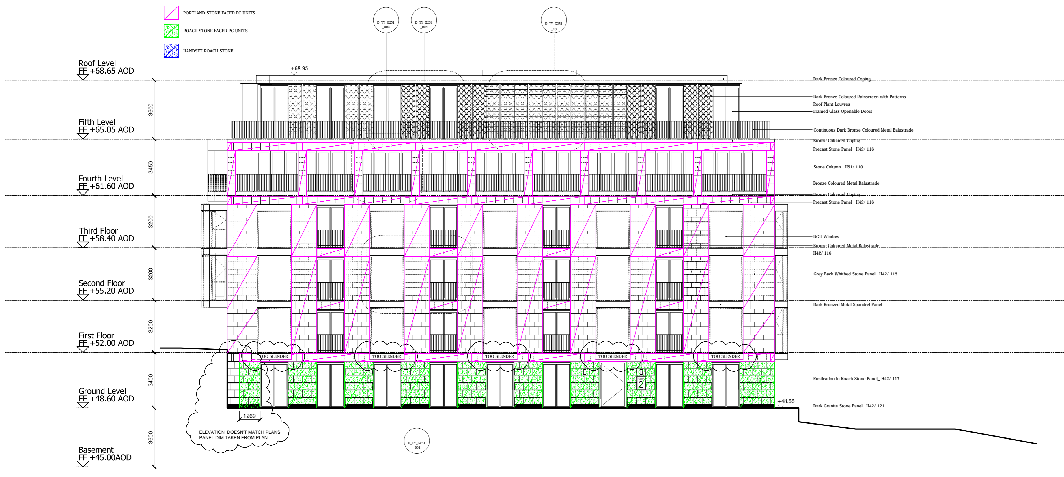
BLOCK 2 - West Elevation