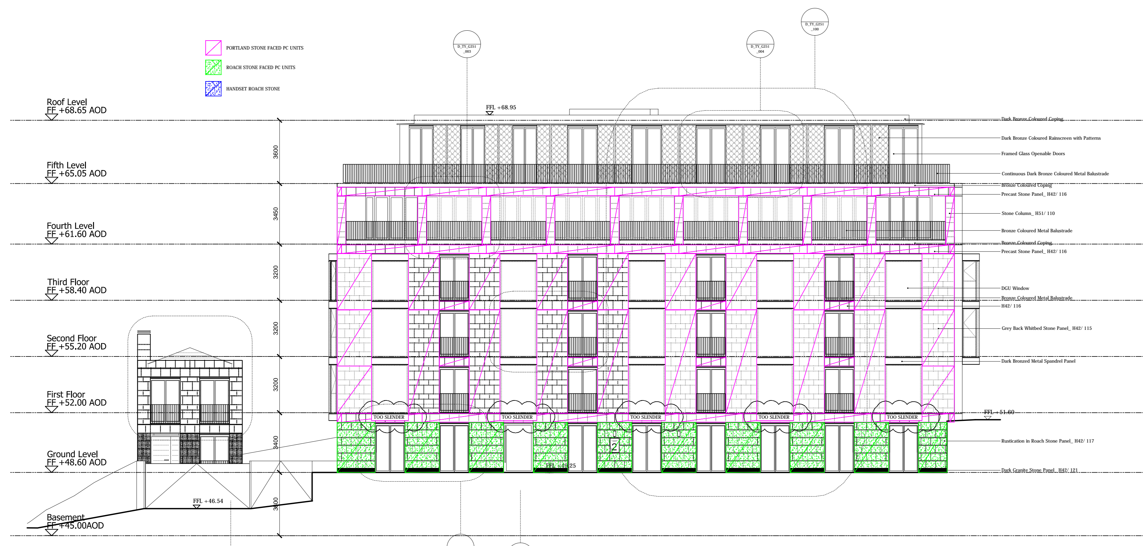
BLOCK 2 - East Elevation