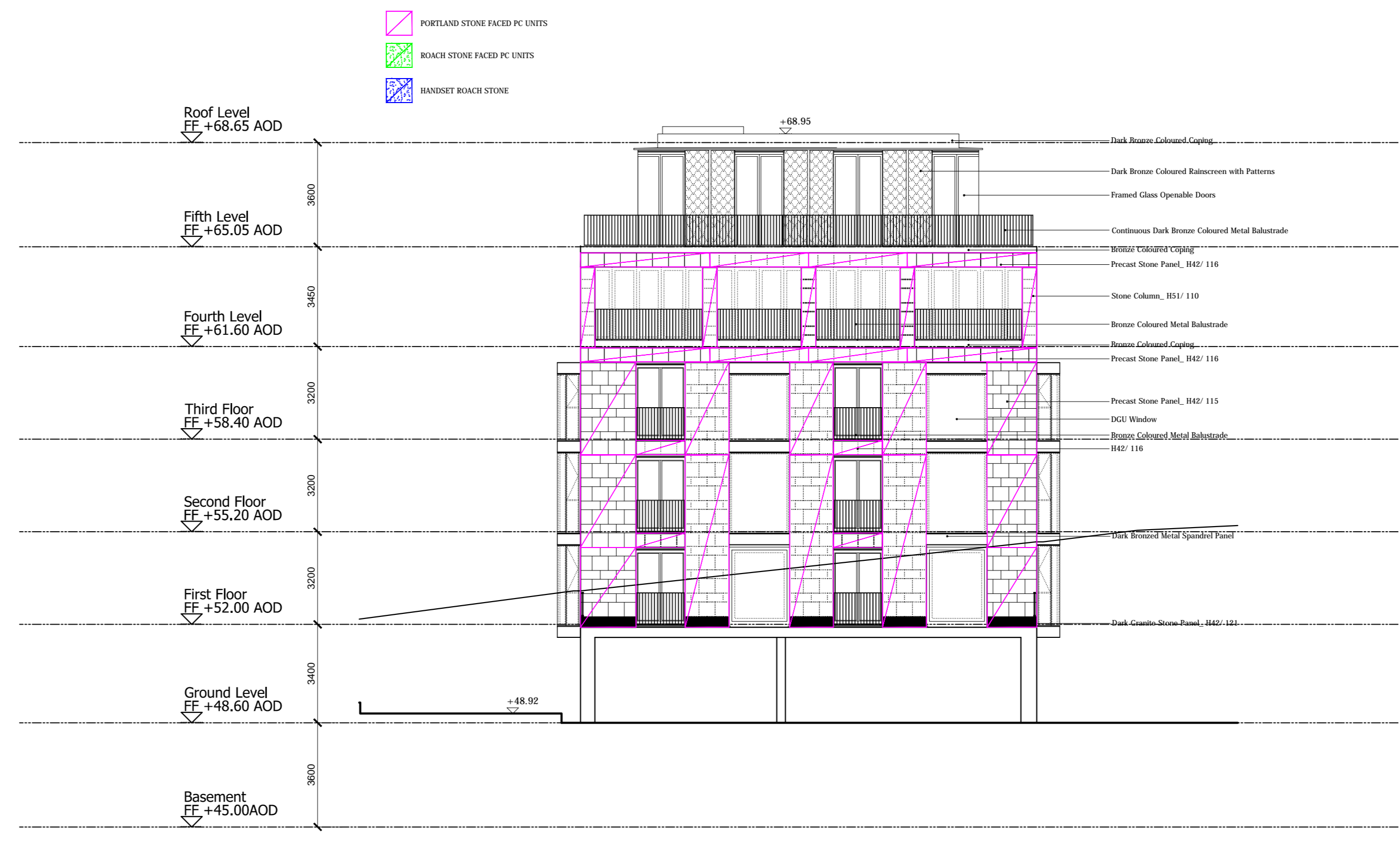
BLOCK 2 - North Elevation