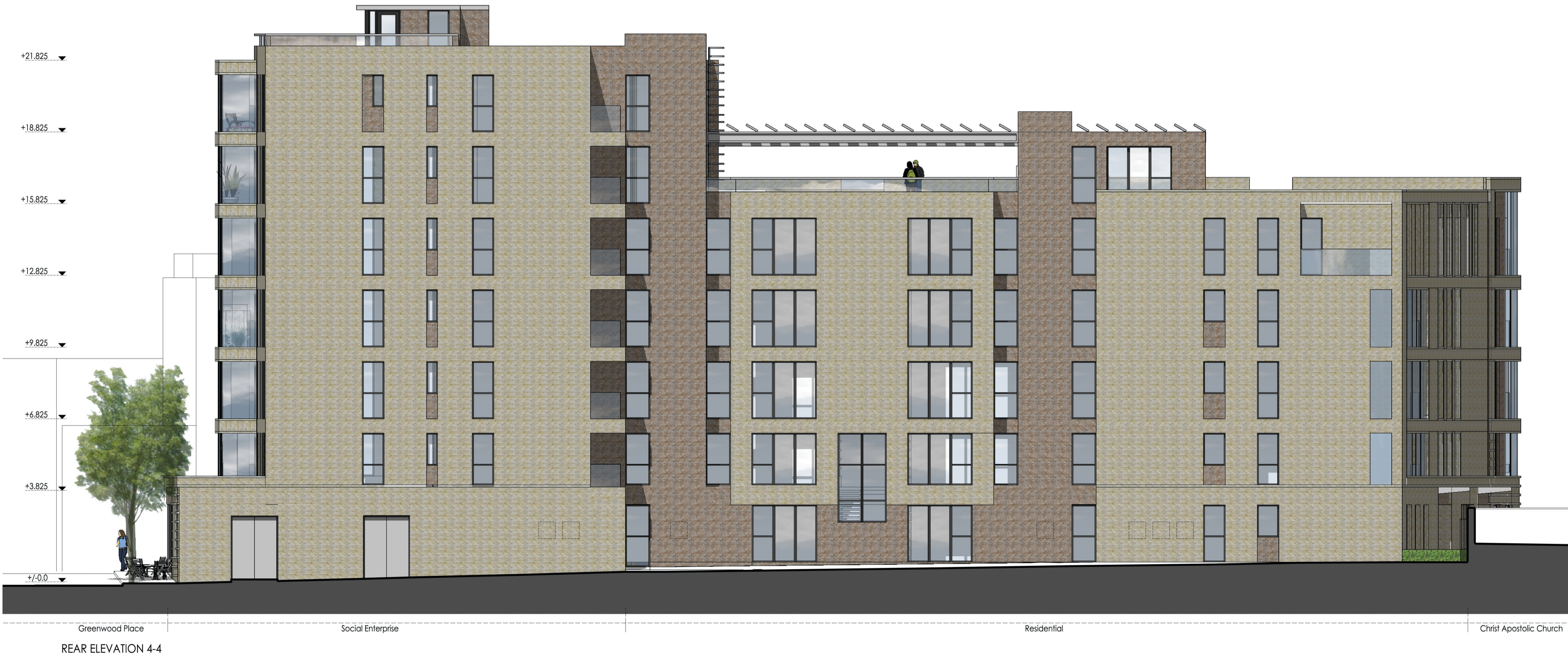
REAR ELEVATION 4-4