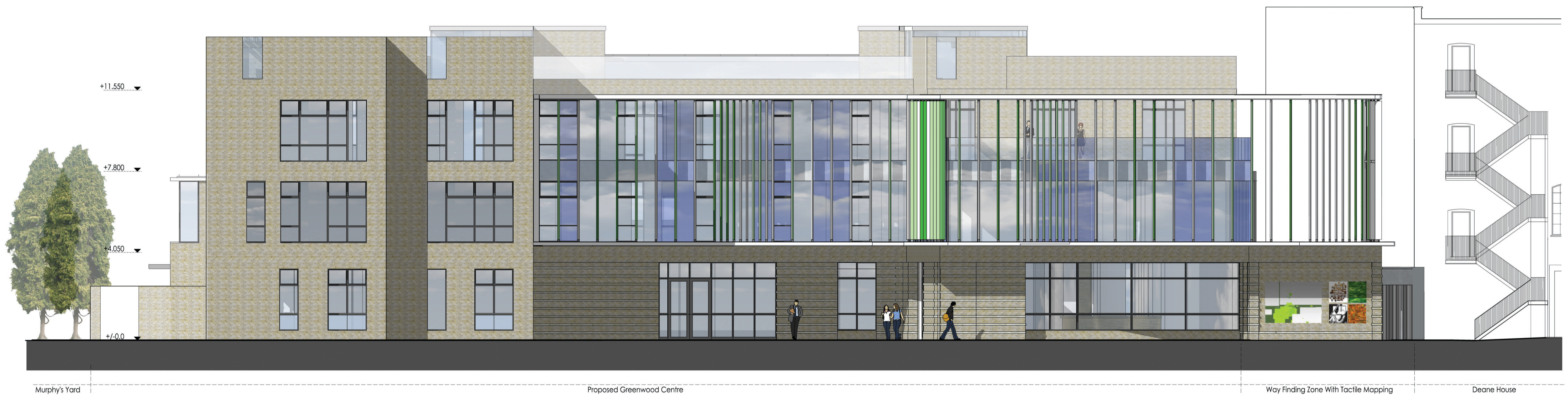
GREENWOOD PLACE ELEVATION 1-1