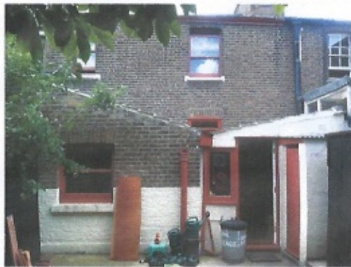
Existing rear of No. 20 Oak Village