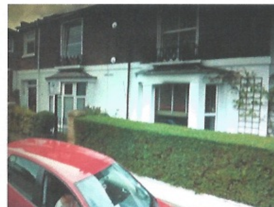
Nos 15 & 16 Extensions beyond front of property