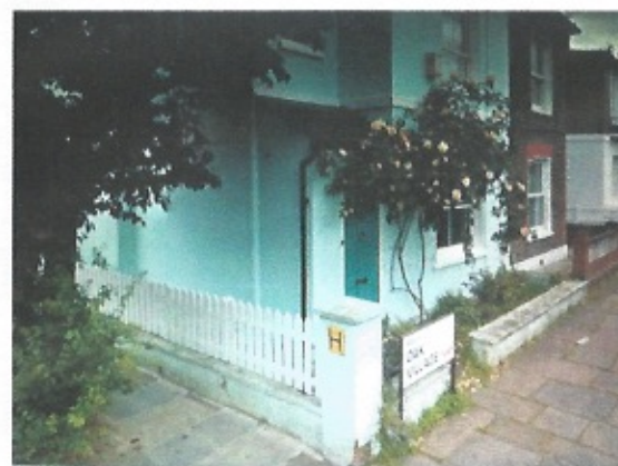
Front Porch of No. 22 Oak Village