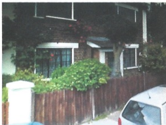
Front Porch of No. 21 Oak Village