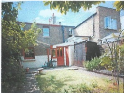
Existing rear of No. 20 Oak Village (showing No.19 rear extension)