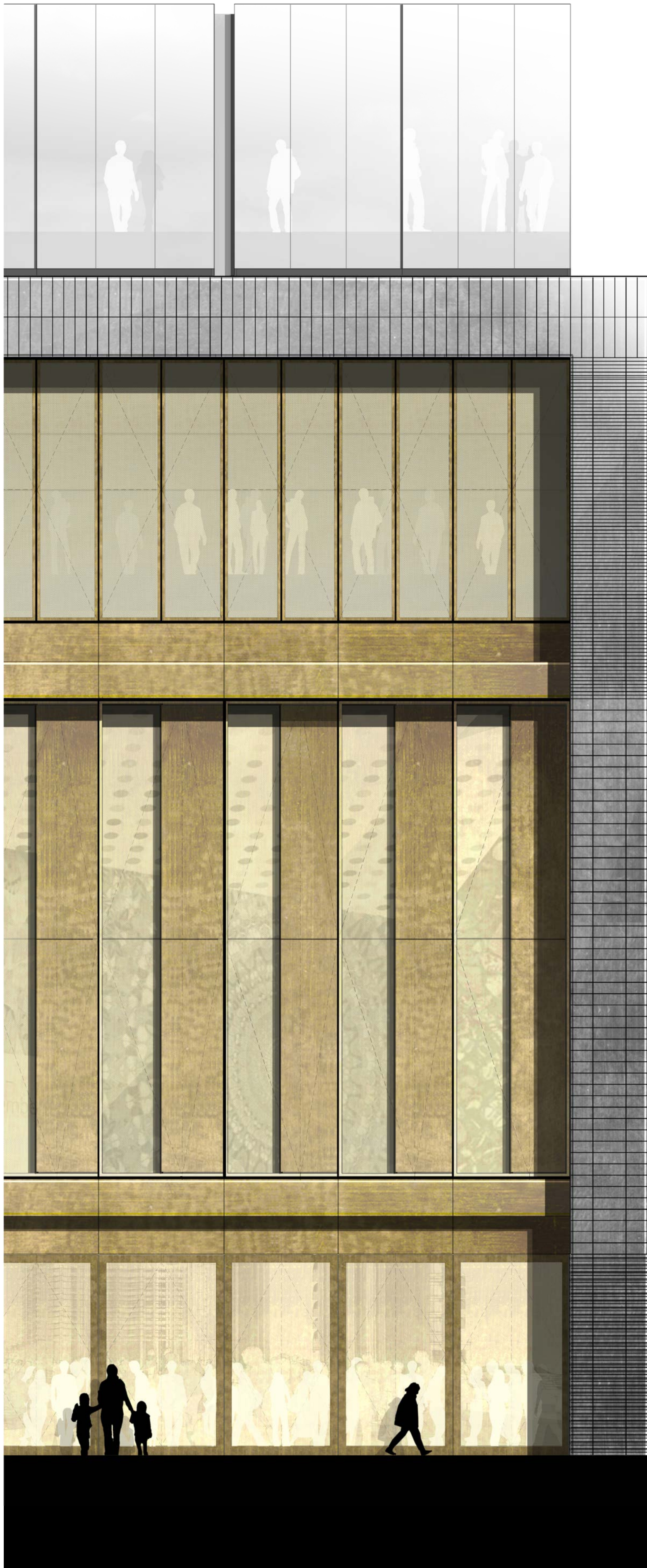
01 Urban Gallery External Bay Elevation 23-09 Facade Closed NA

Do not scale. All dimensions to be confirmed on site. Information contained in this drawing is the sole copyright of ORMS Designers & Architects Ltd. and is not to be reproduced without permission.