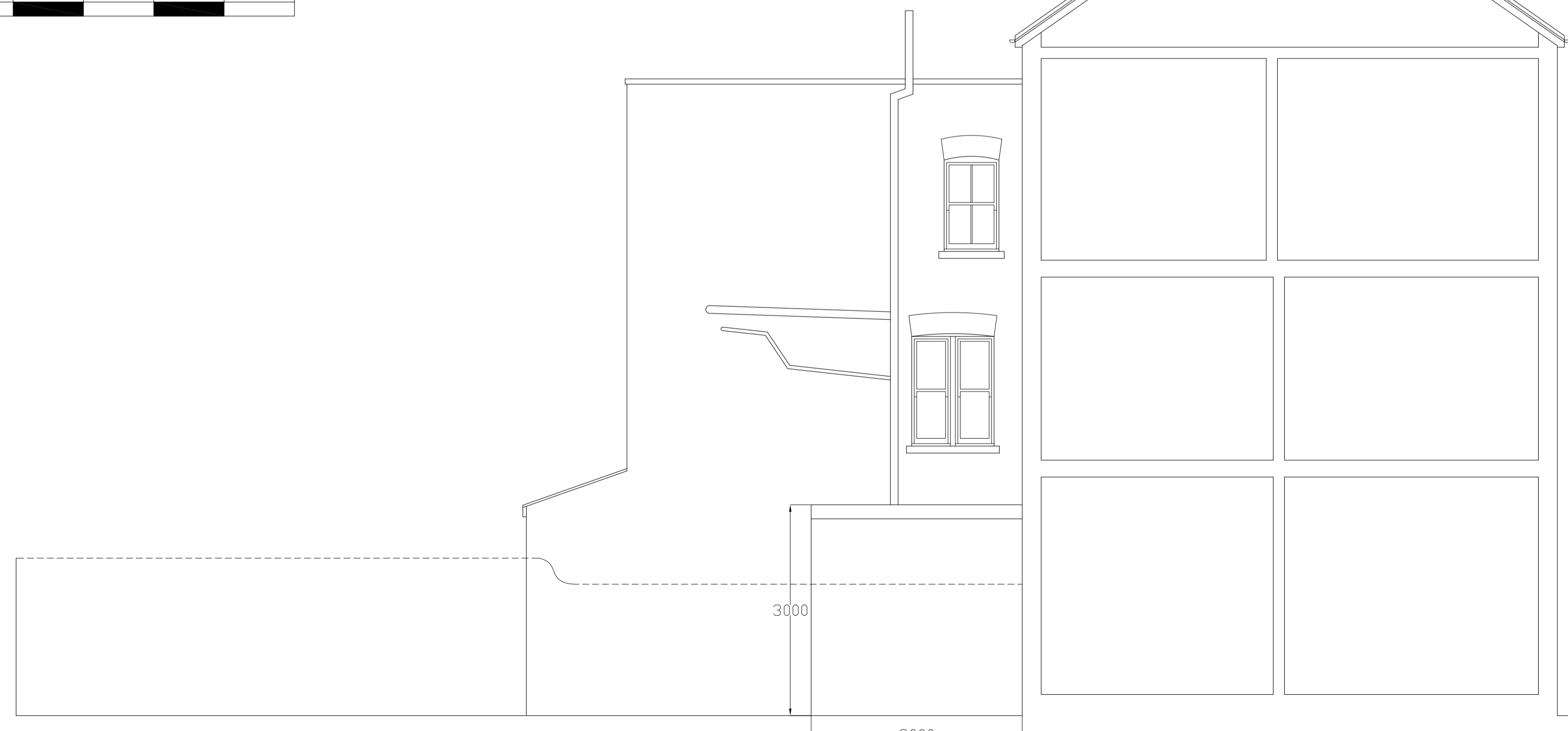
No101. Side Elevation/Section

3000 New brickwork to match existing. White painted timber doors.