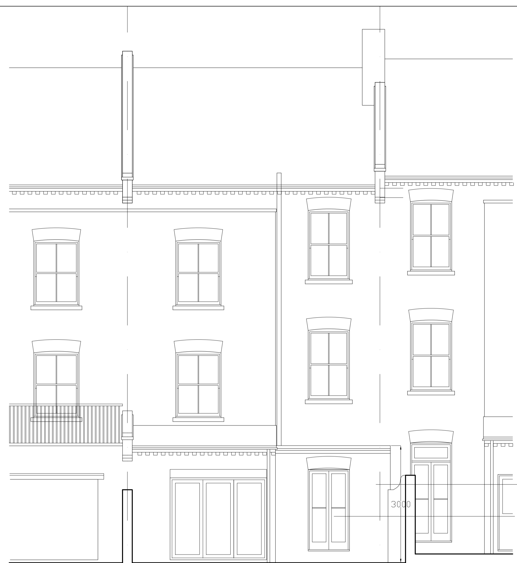
No101. Rear Elevation