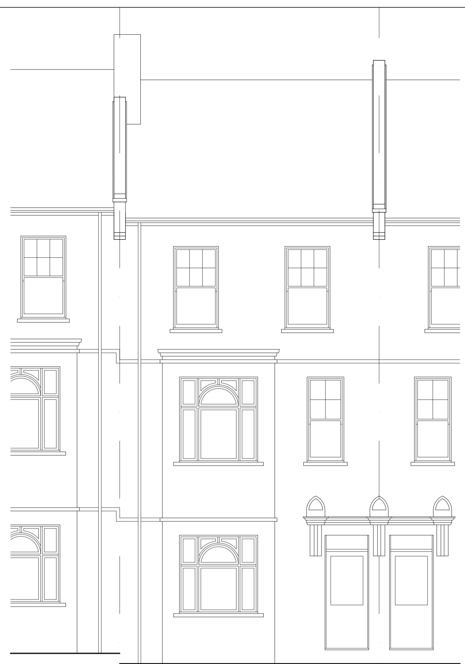
No101. Front Elevation

DO NOT SCALE FROM THIS DRAWING. CHECK ALL DIMENSIONS ON SITE. IF INFORMATION IS NOT CLEAR OR CONSISTANT CONSULT ARCHITECT. THIS DRAWING IS COPYRIGHT.