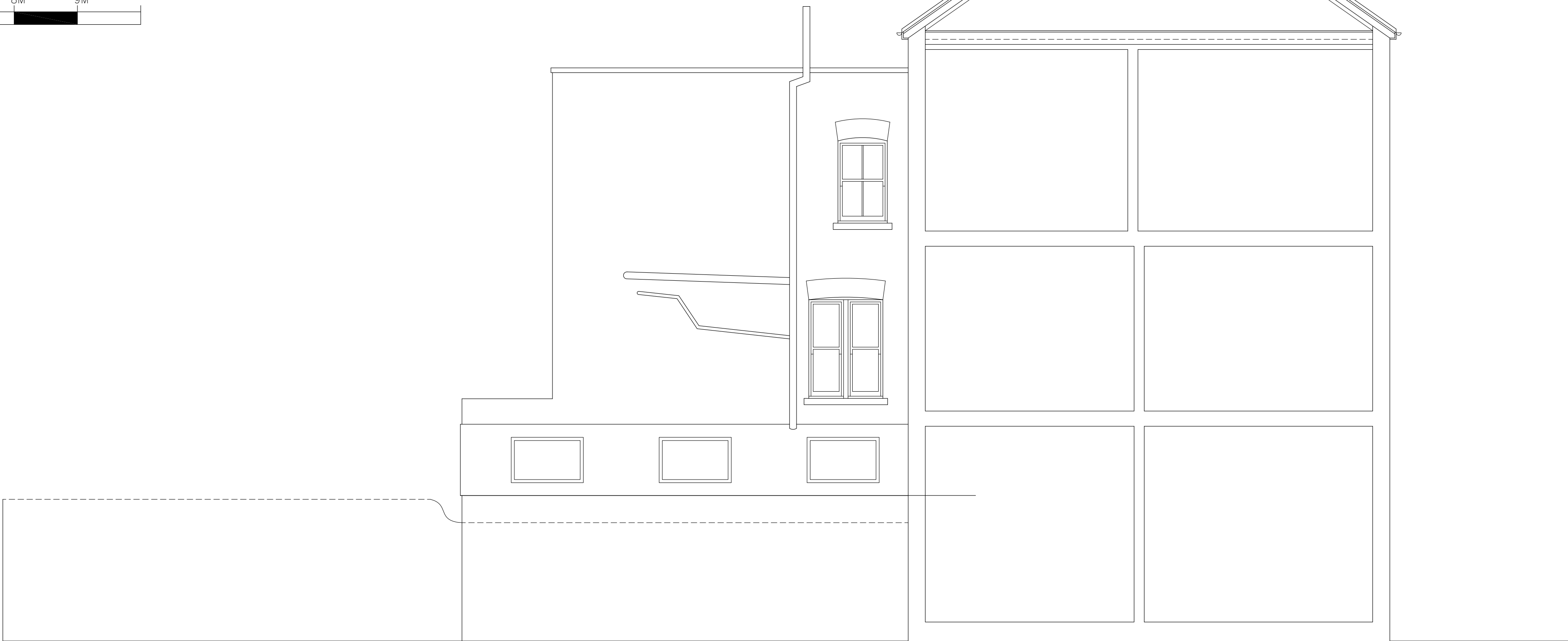
No101. Side Elevation/Section

B 27.10.13 Side extension revised A 26.07.11 Side extension revised