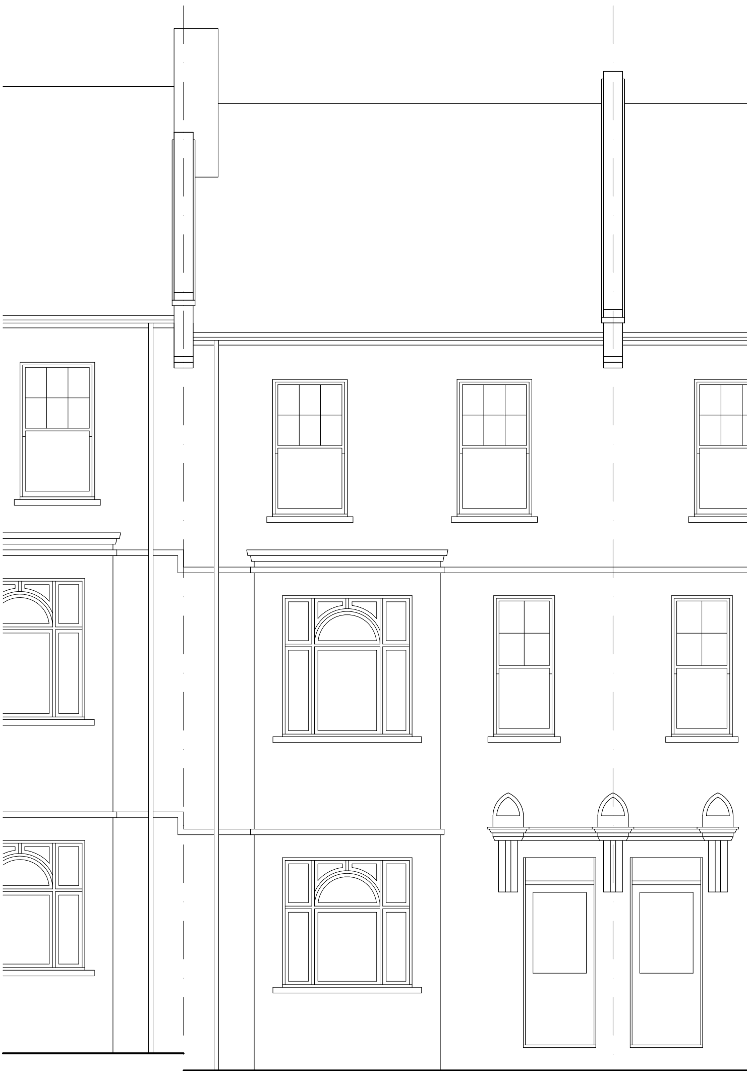
No101. Front Elevation

DO NOT SCALE FROM THIS DRAWING. CHECK ALL DIMENSIONS ON SITE. IF INFORMATION IS NOT CLEAR OR CONSISTANT CONSULT ARCHITECT. THIS DRAWING IS COPYRIGHT.