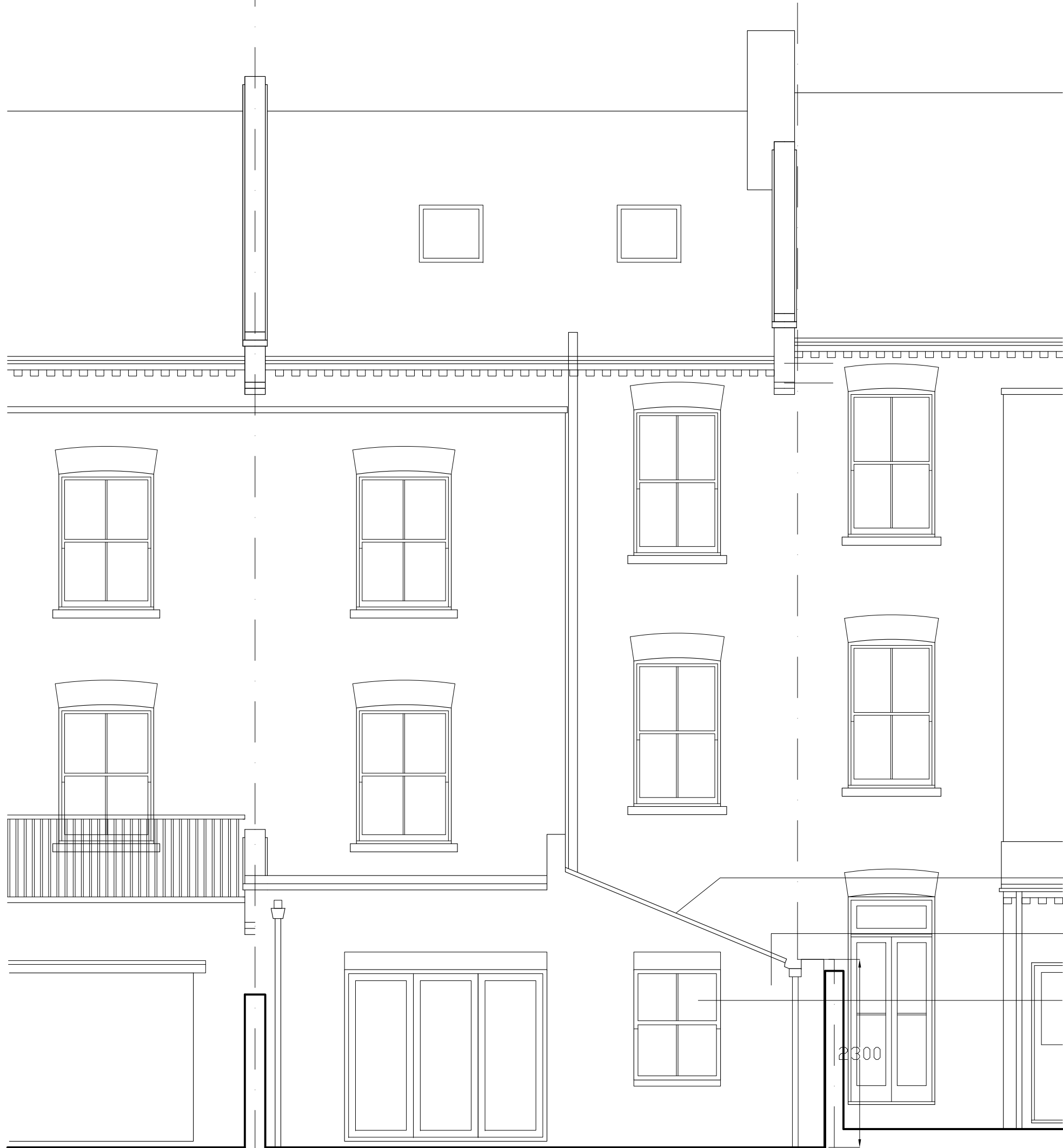
No101. Rear Elevation