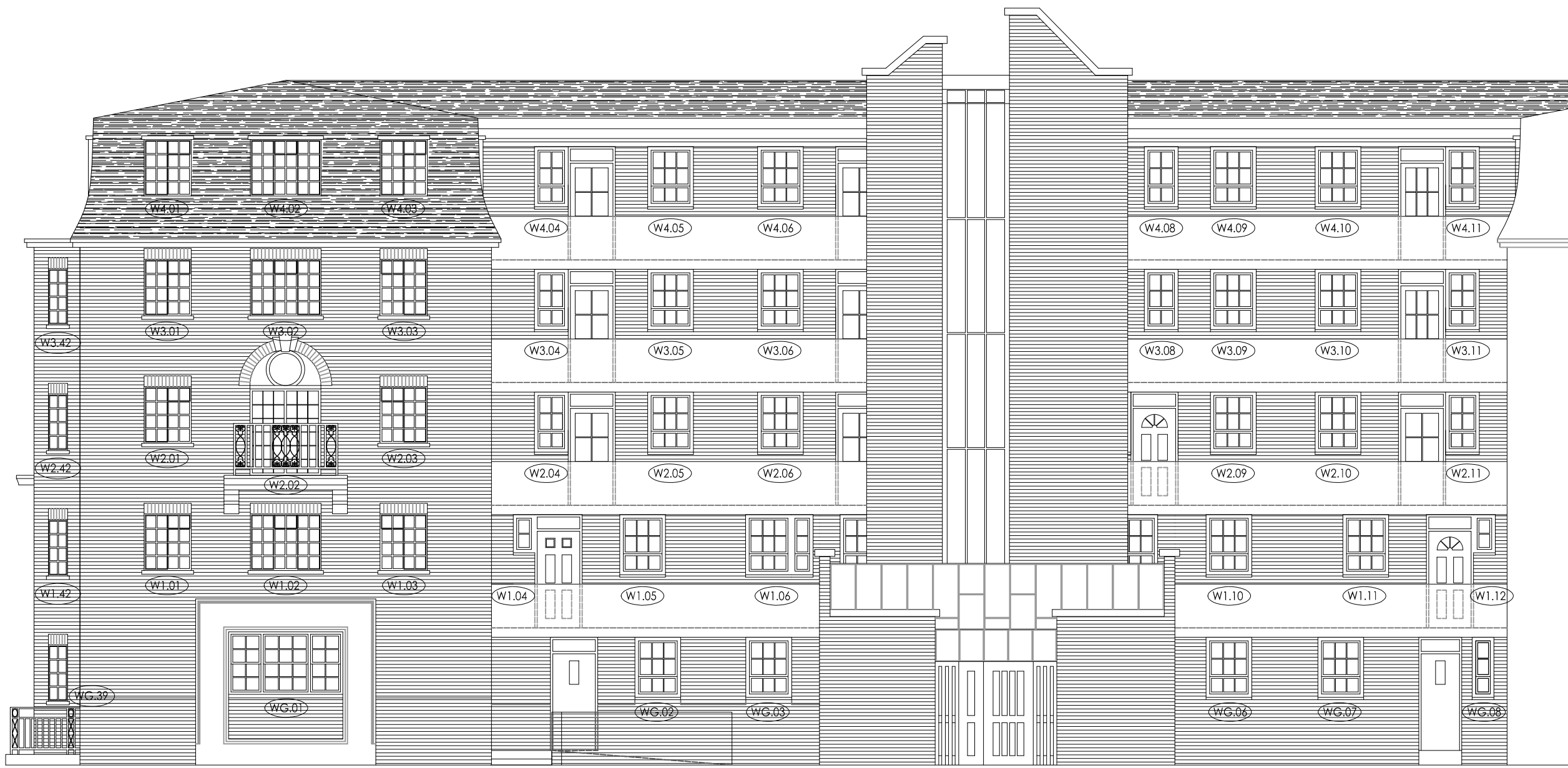
NORTH-WEST ELEVATION (TOWER SHOWN)