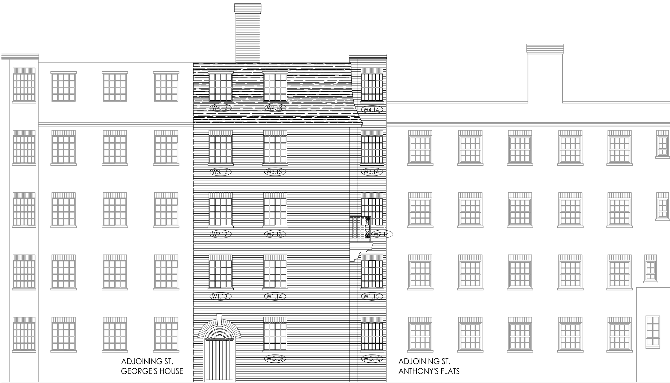
ELEVATION A (SOUTH-WEST)