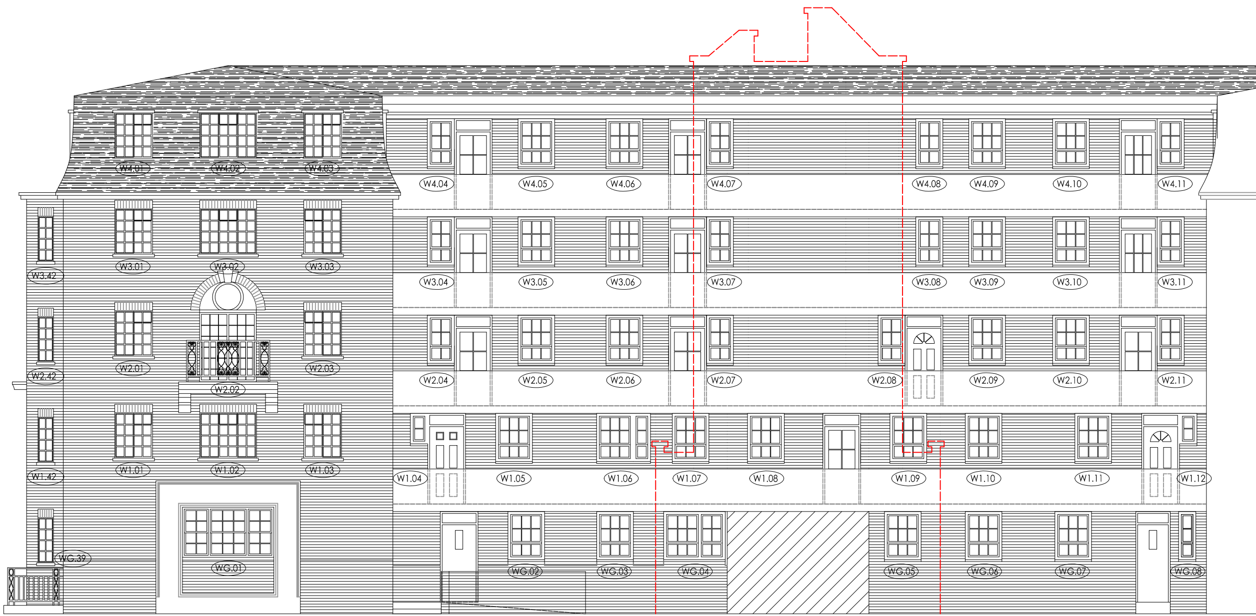
NORTH-WEST ELEVATION (BEHIND TOWER)