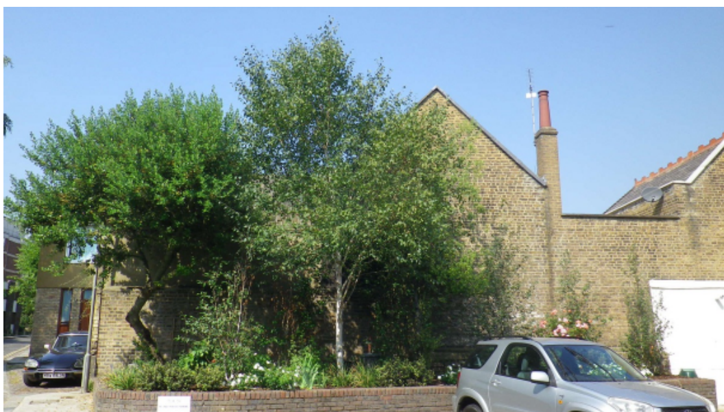
East elevation of site neighbouring No.12 Primrose Hill Studios