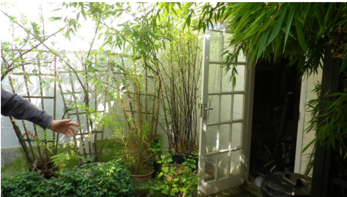
Location of proposed link infill extension within courtyard