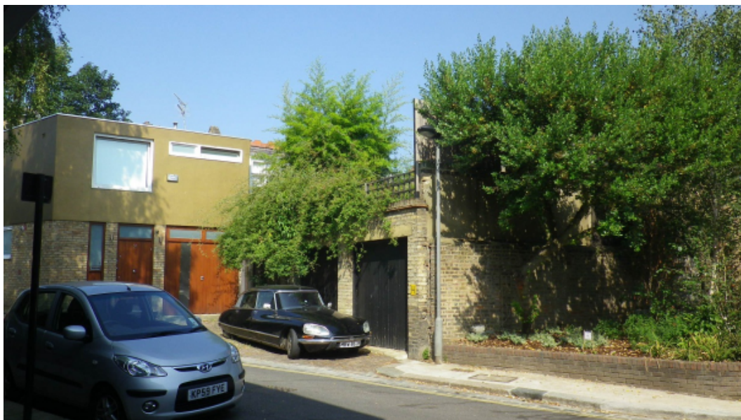
Views of existing garage fronting Kingstown Road