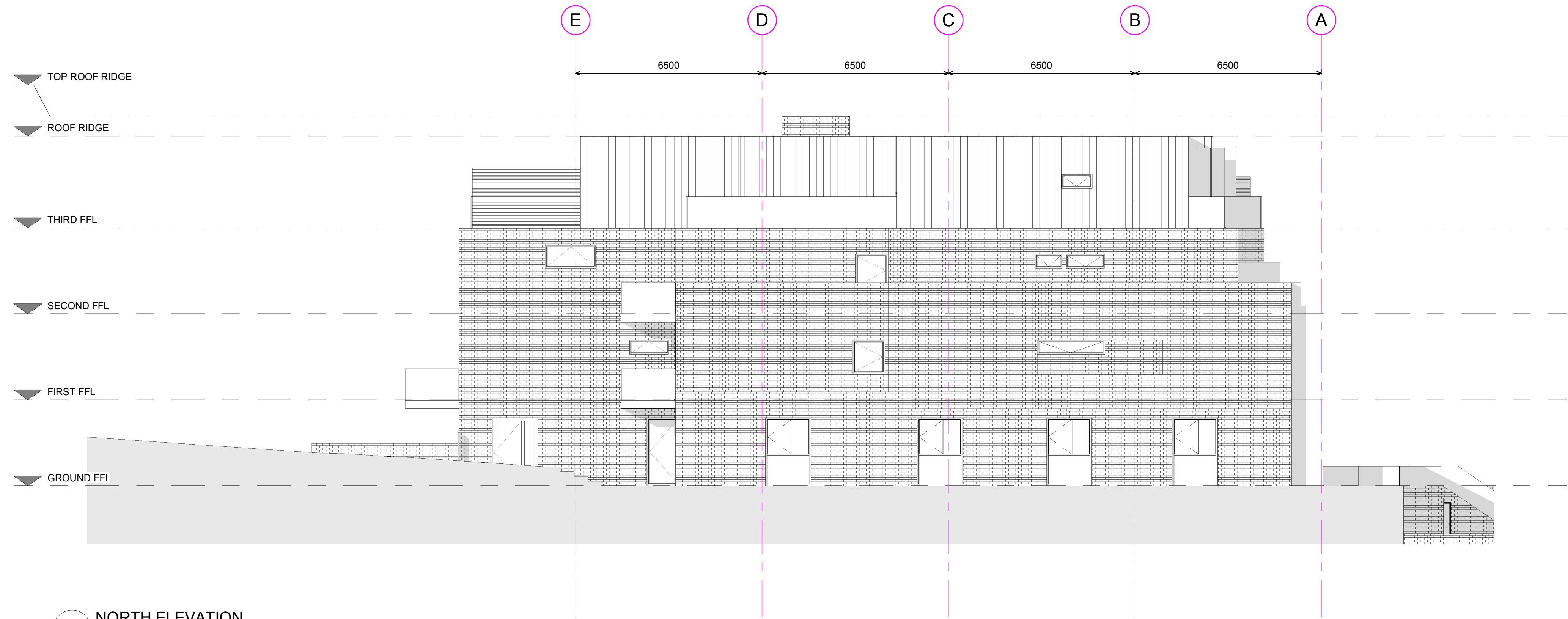
1 NORTH ELEVATION