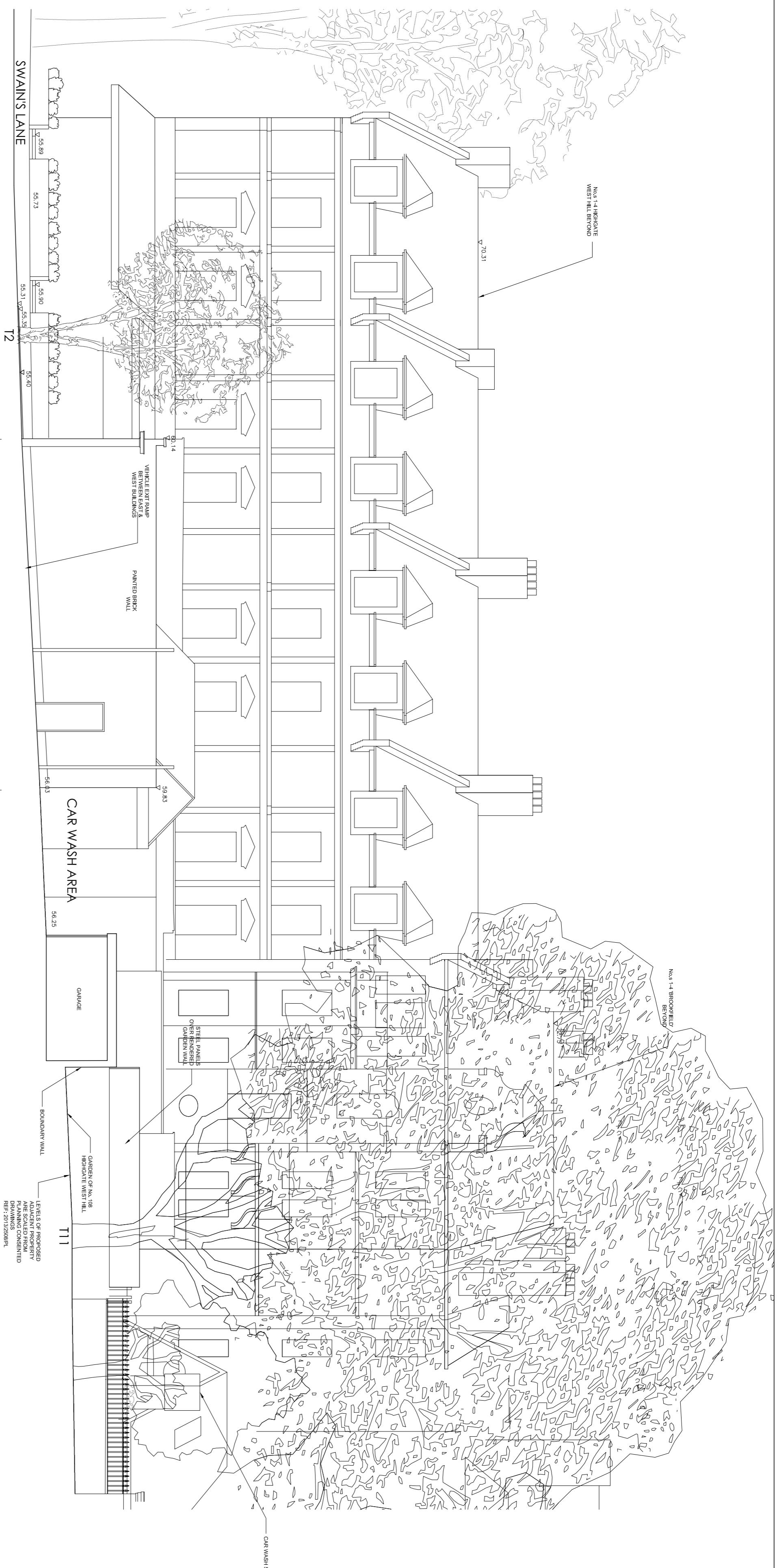
W. BUILDING EAST ELEVATION (Vehicle Lane)