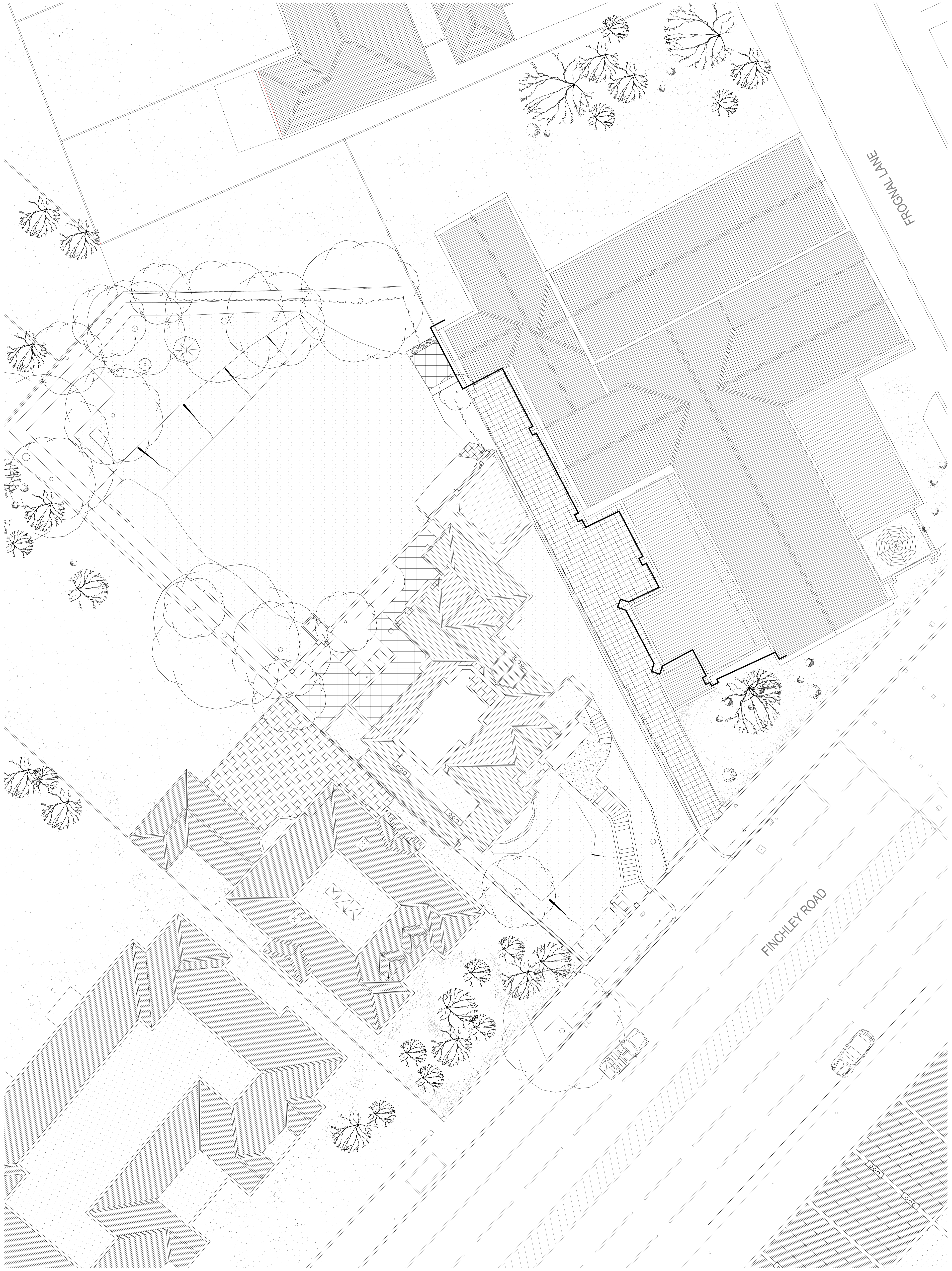
01 EXISTING Third Floor Plan 1:100 (A0)