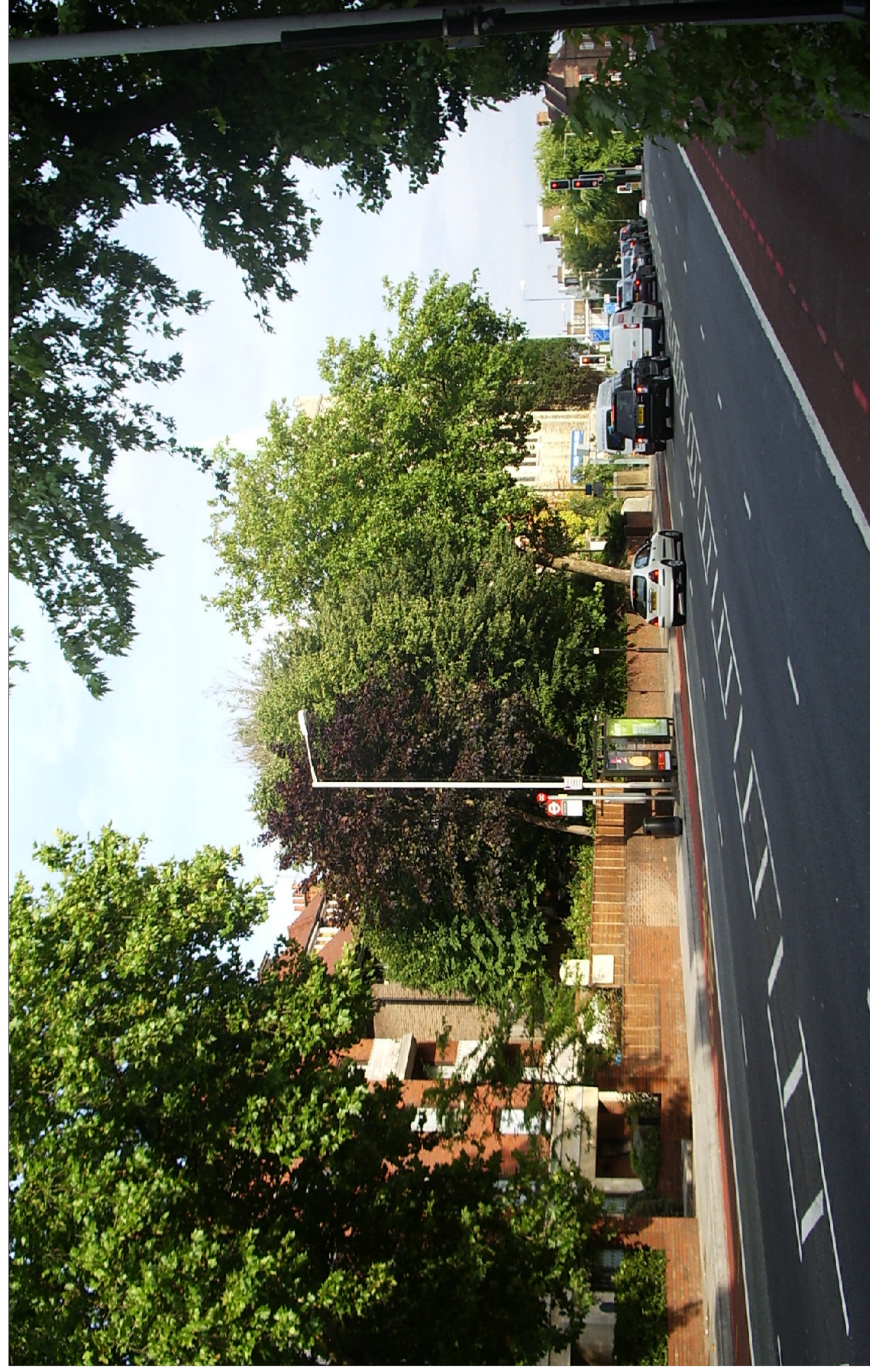
2 VIEW TO FINCHLEY ROAD