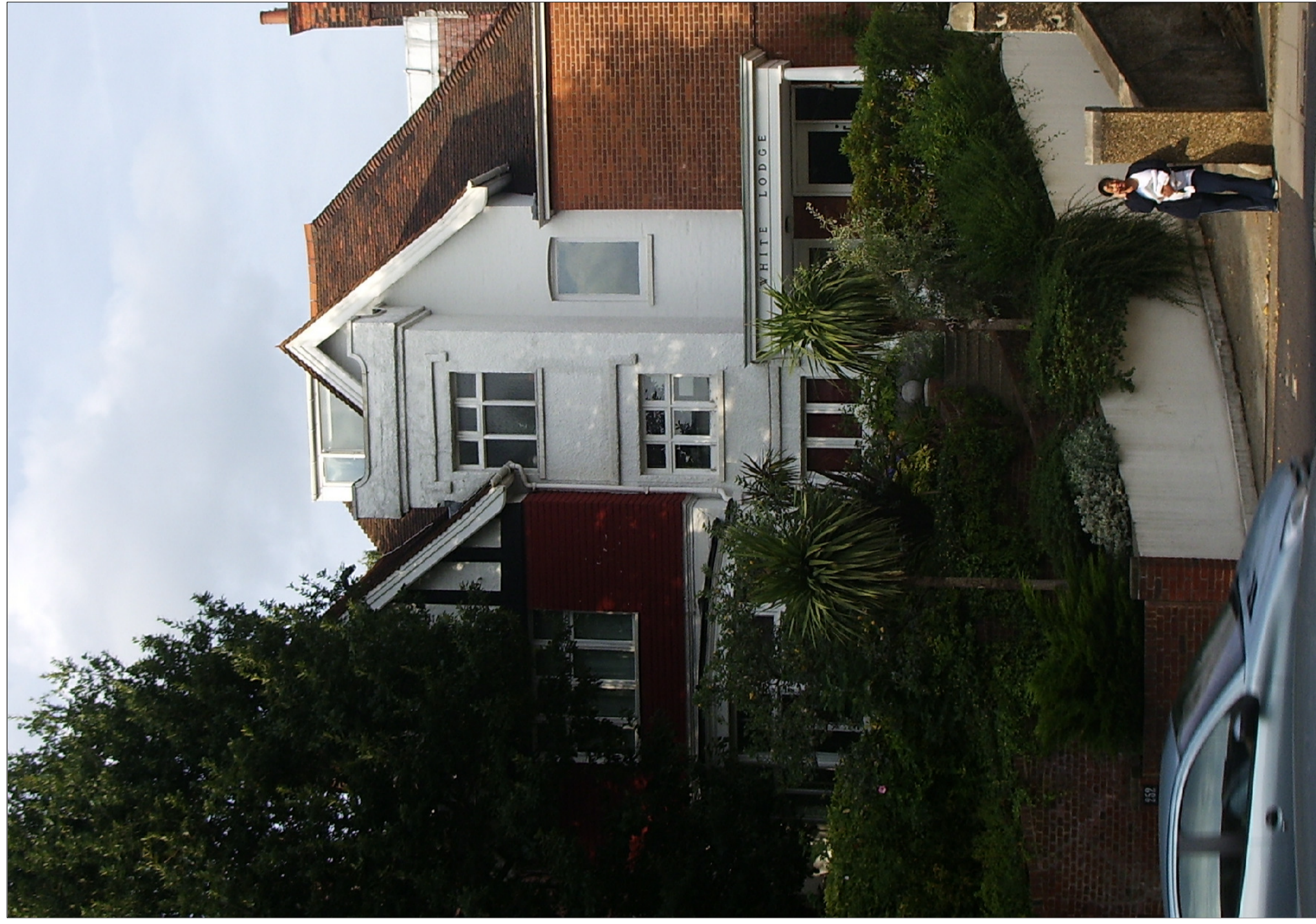
4 VIEW TO 282 FINCHLEY ROAD