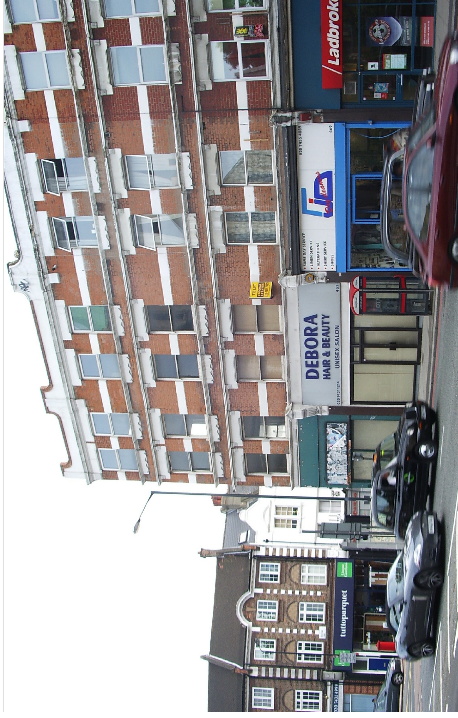
6 VIEW TO BUILDING OPOSITE 282 FINCHLEY ROAD