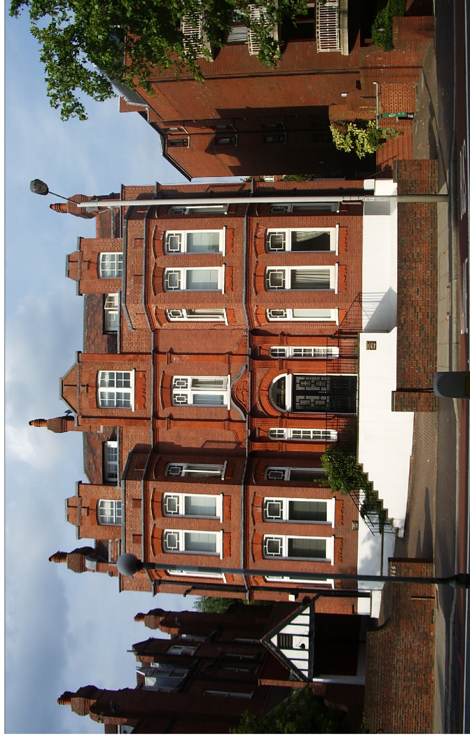
7 VIEW TO 260 FINCHLEY ROAD