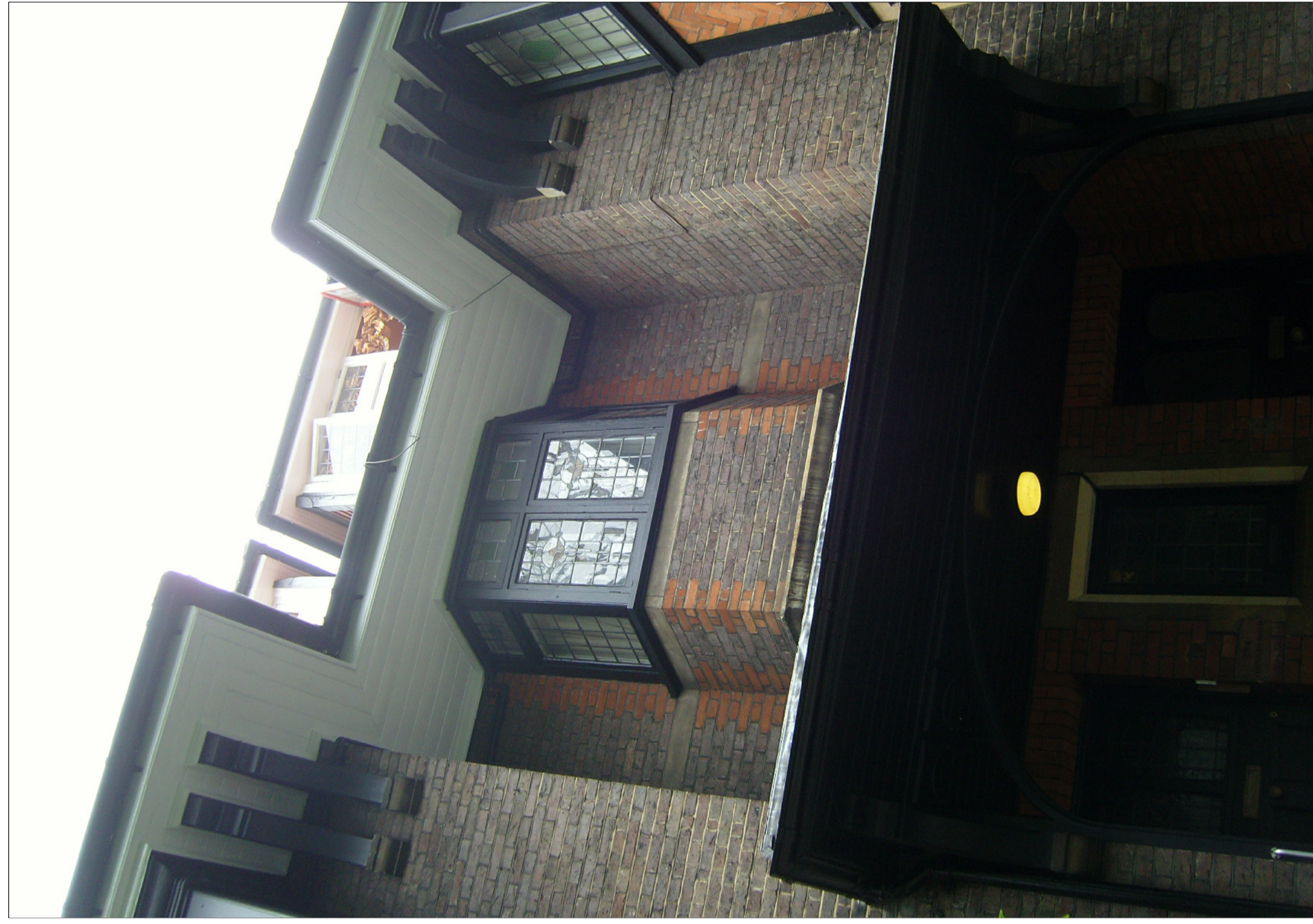
5 VIEW TO FACADE DETAIL OF 254 FINCHLEY ROAD