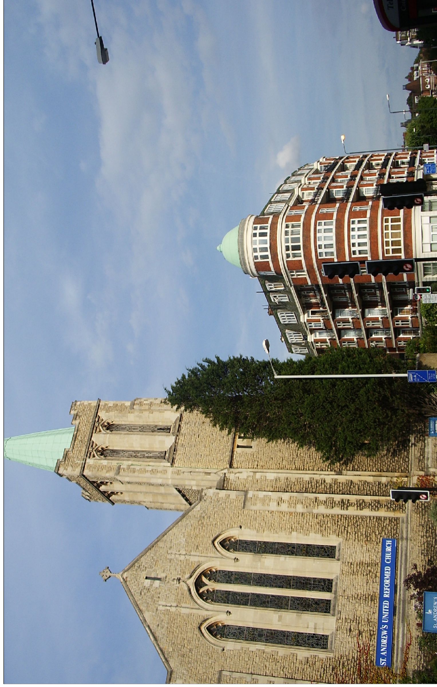
1 VIEW TO ST. ANDREW'S CHURCH AND PALACE COURT FROM FINCHLEY ROAD