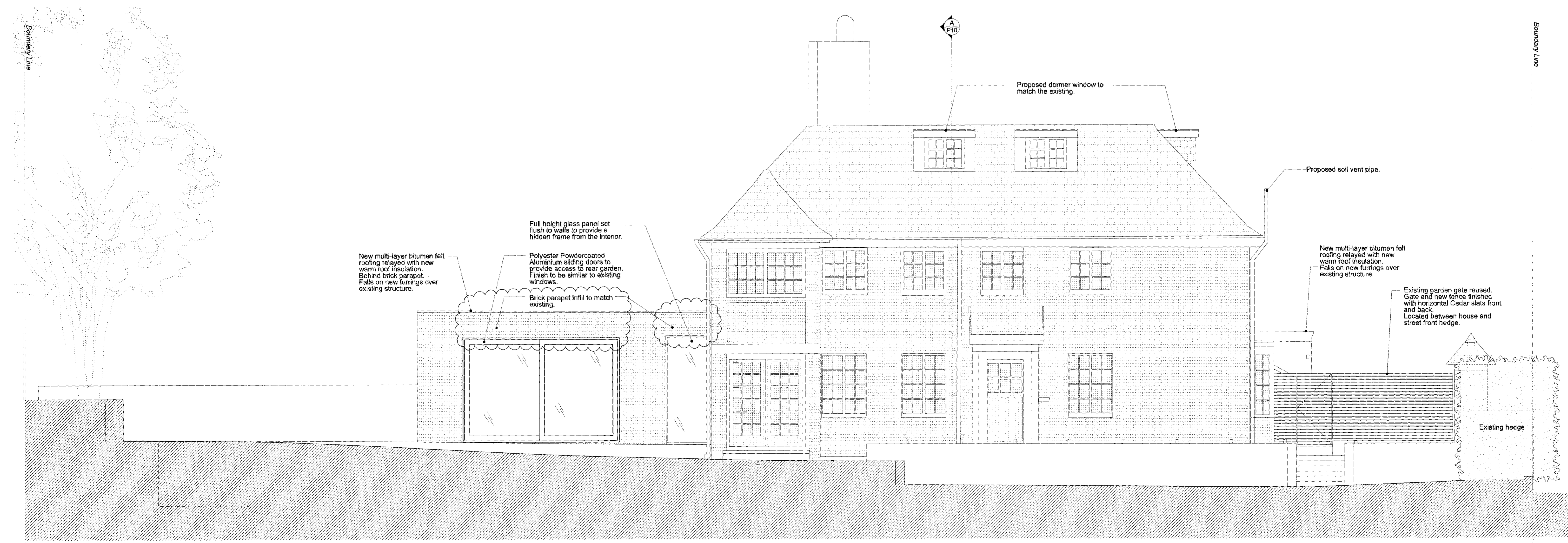
20 FROGNAL GARDENS PROPOSED WEST ELEVATION