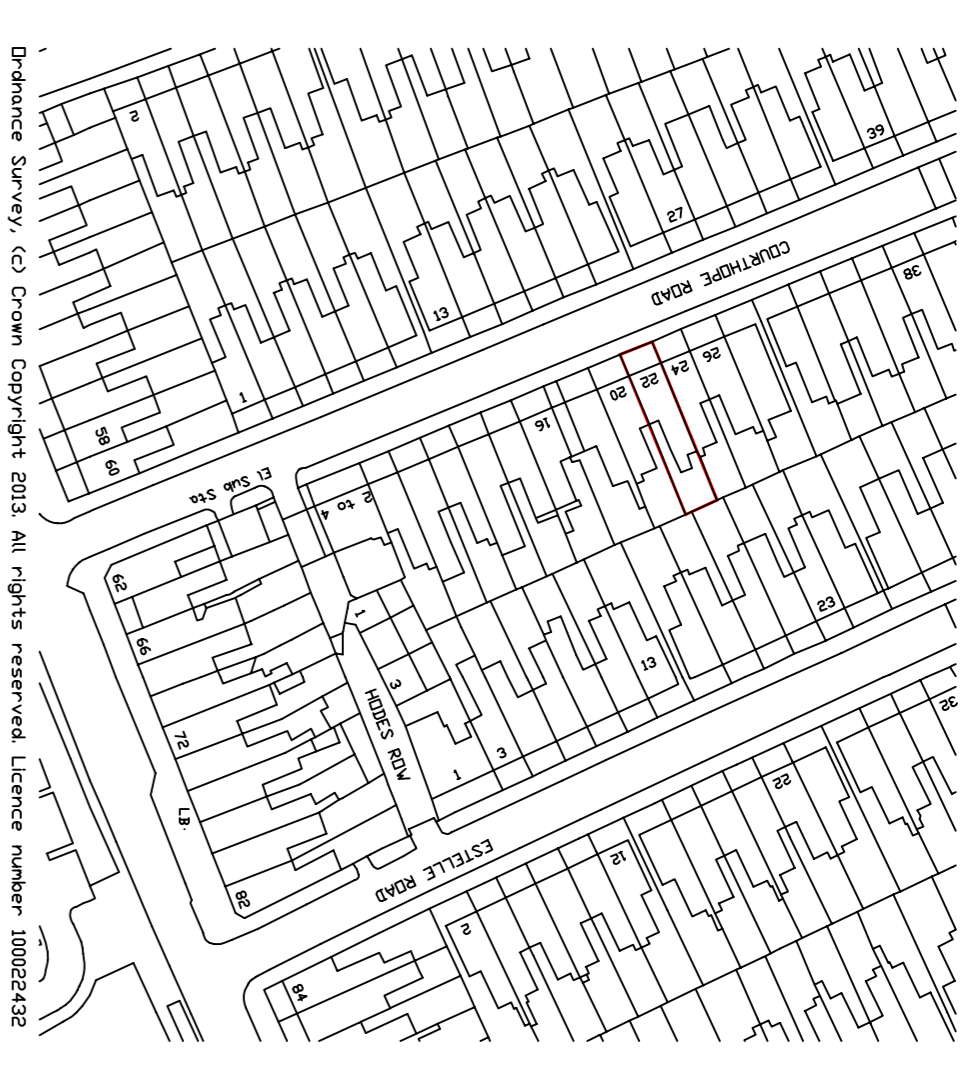
AREA PLAN SCALE 1:1250