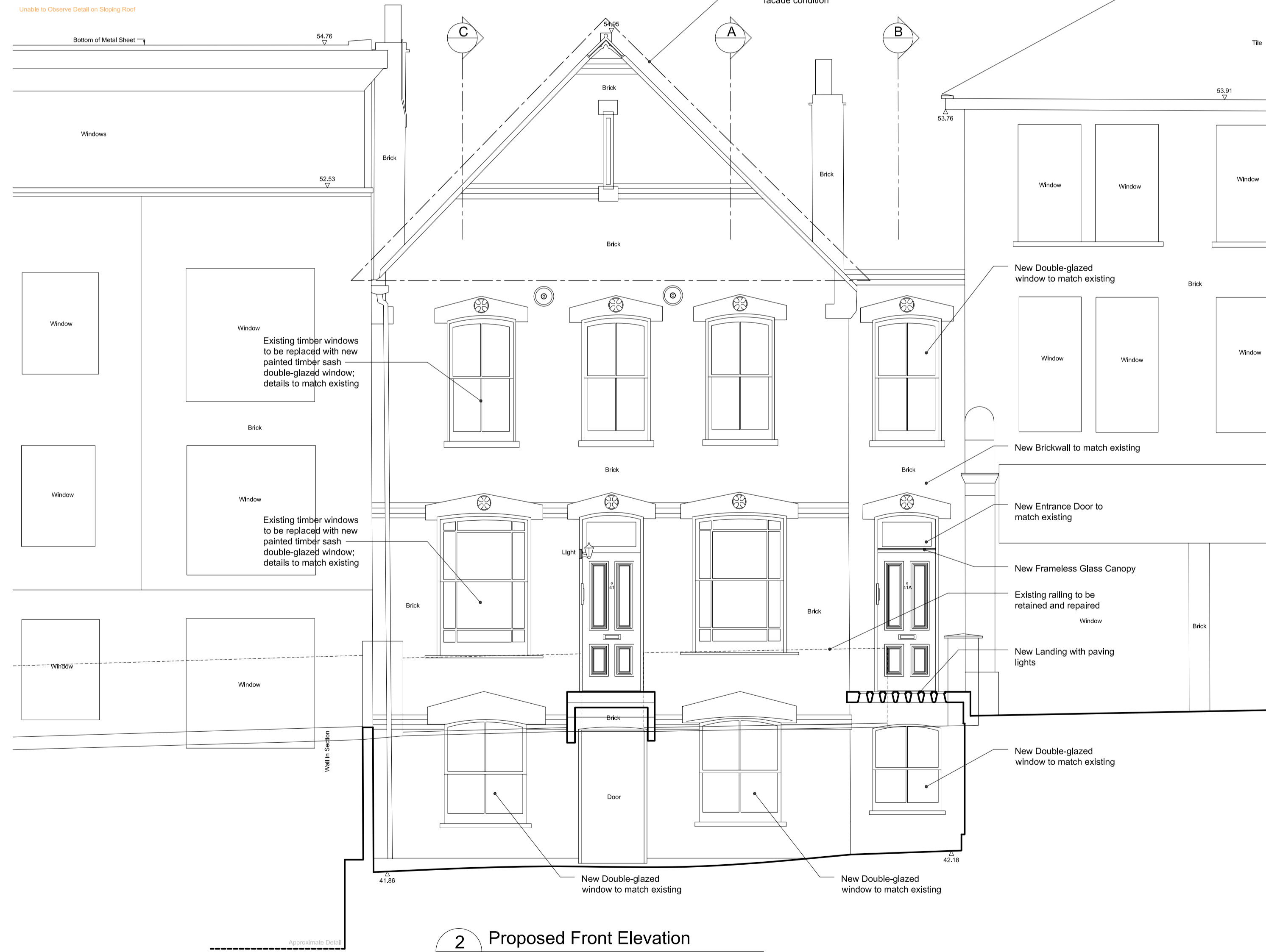
2 Proposed Front Elevation

Unable to Observe Detail on Sloping Roof