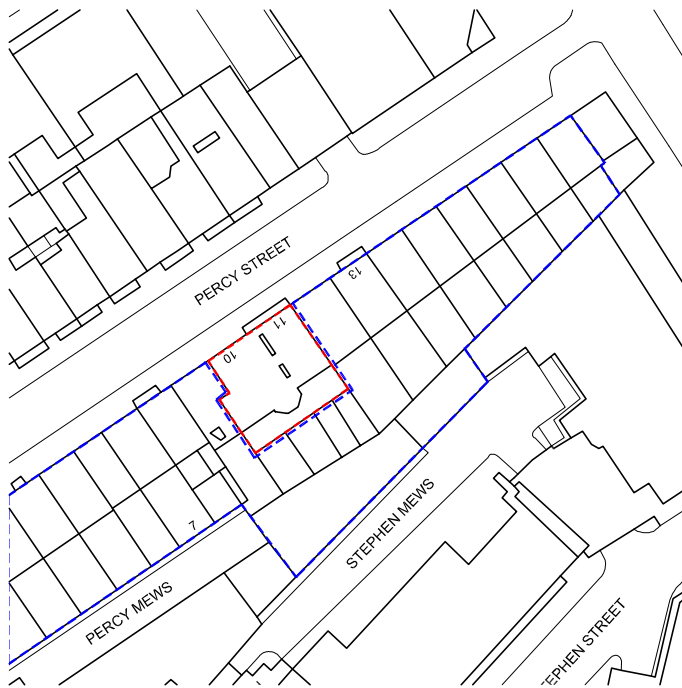
Site Location Plan Scale 1:1250