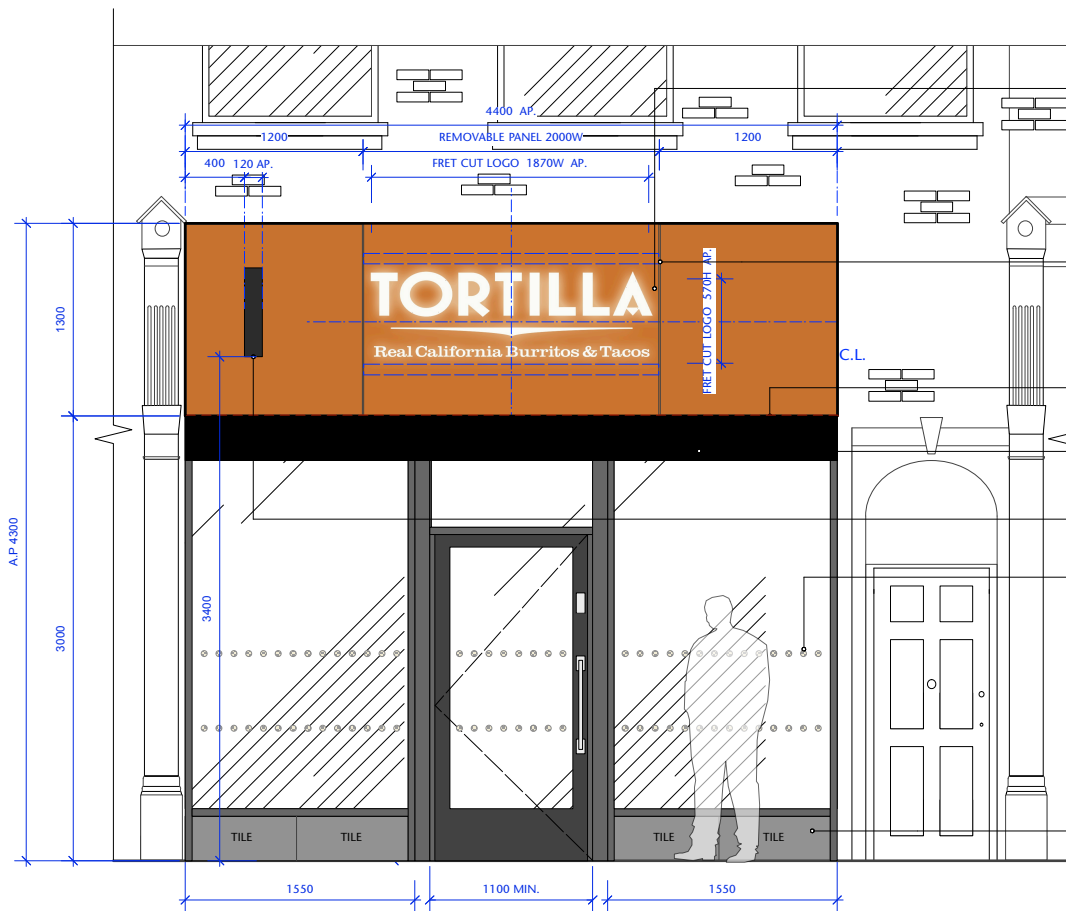
A EXTERIOR ELEVATION A SCALE 1:25@A1/1:50@A3

WHITE POWDER COATED STEEL BACKING VISIBLE THROUGH LETTERS WITH FLUORESCENT LIGHTS BEHIND OPAL ACRYLIC TO TOP AND BOTTOM. FLUORESCENT LOCATIONS INDICATED W/ BLUE DASHED LINE