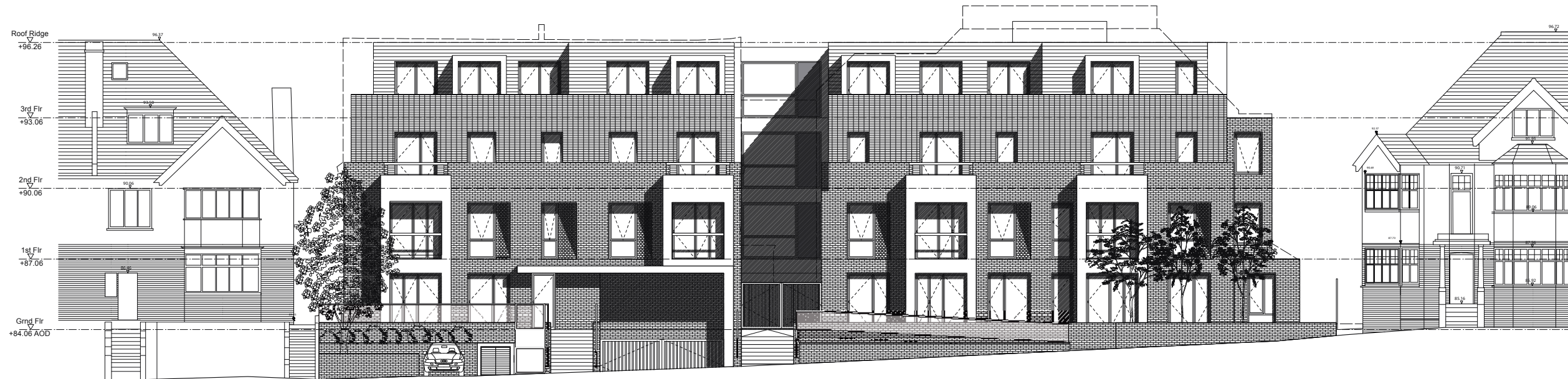
B West Elevation GE.01 1:200