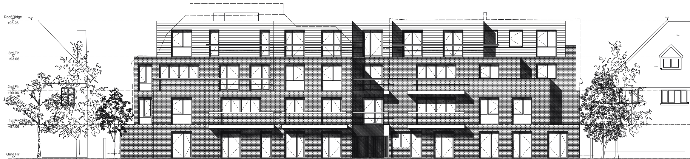
A East Elevation GE.01 1:200