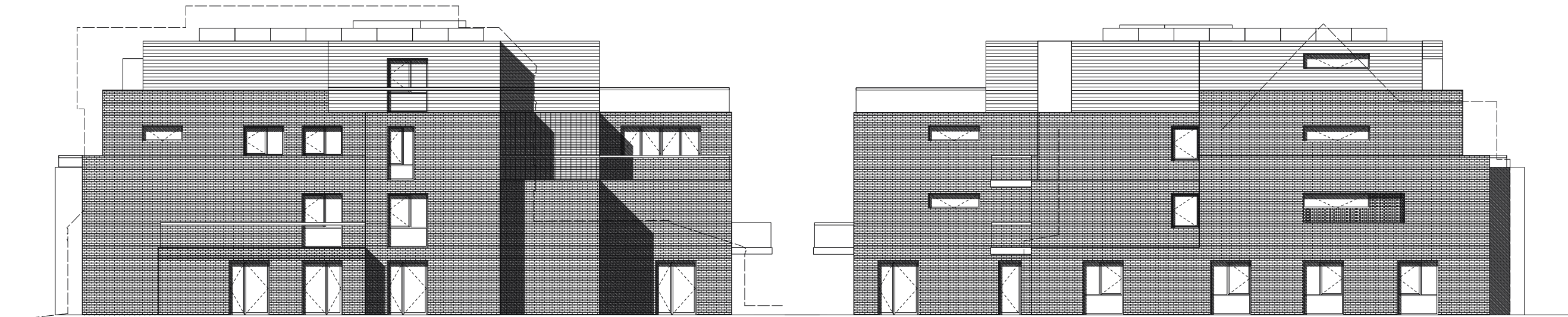
C South Elevation GE.01 1:200