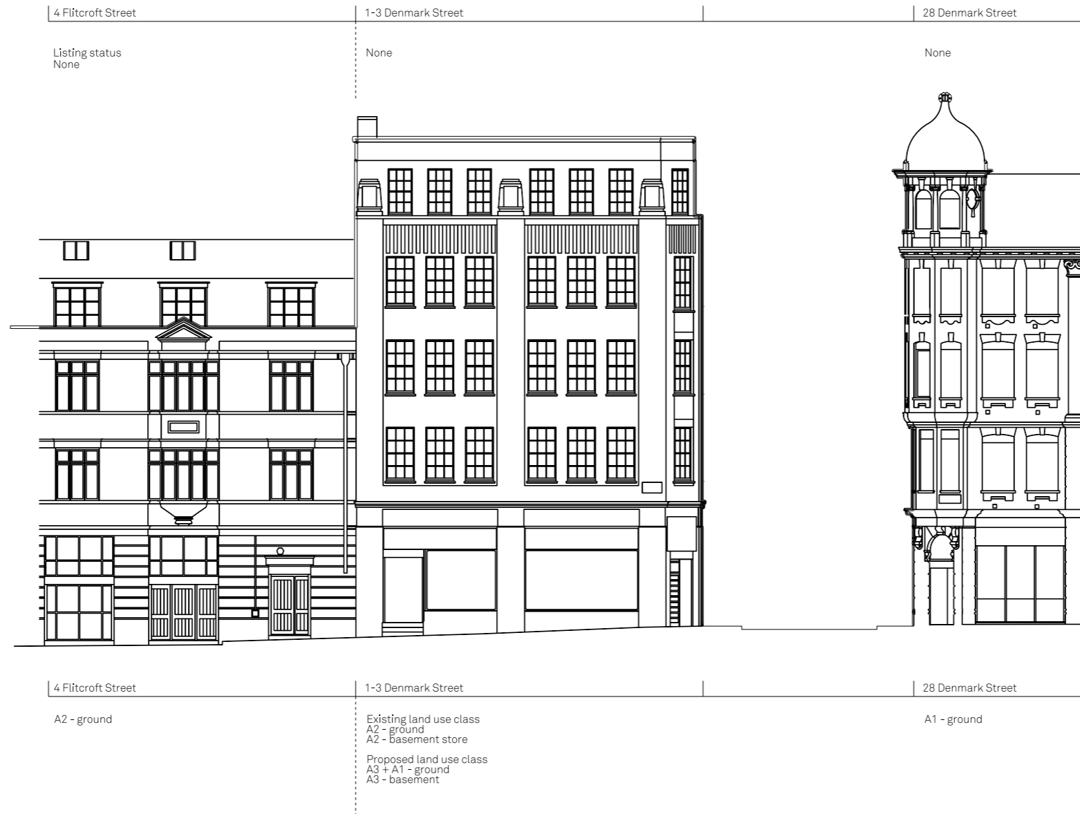
South West Elevation Flitcroft Street