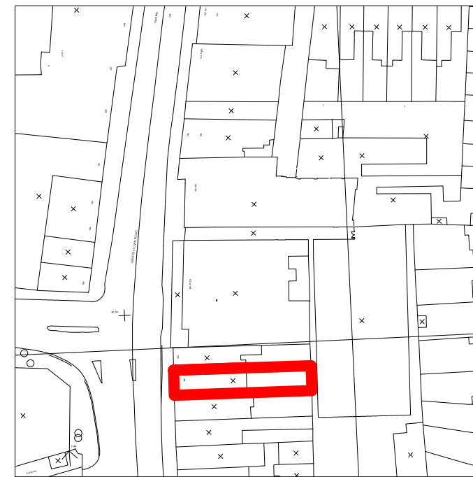
Block plan 1/1250