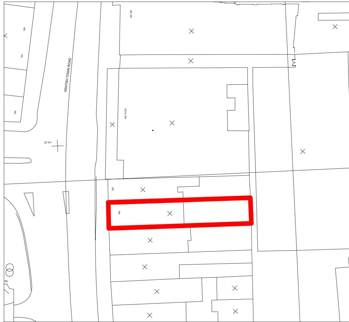
Location plan 1/500