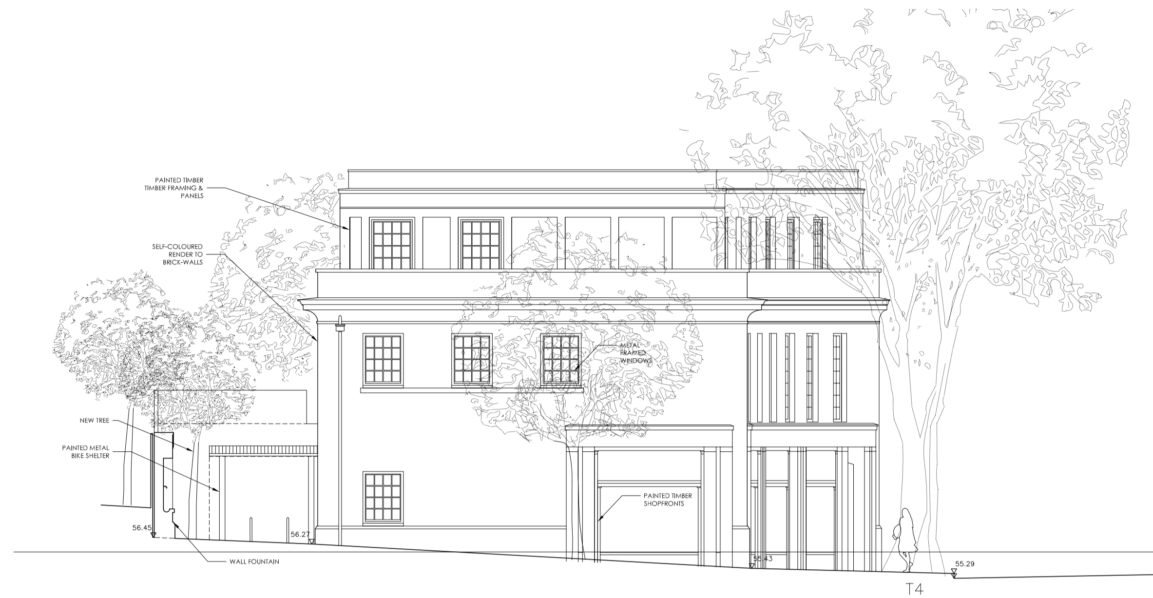
E. BUILDING WEST ELEVATION (SIDE)