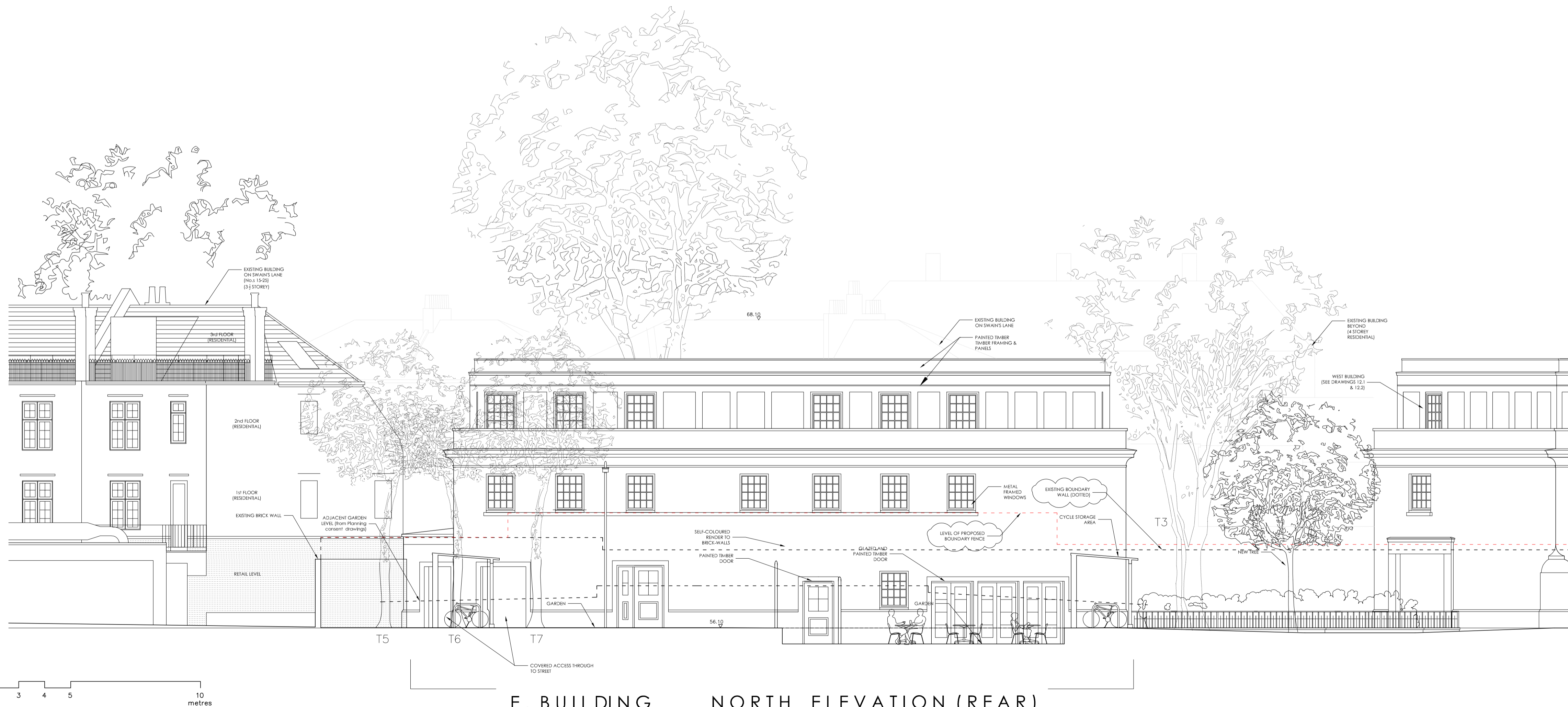
E. BUILDING NORTH ELEVATION (REAR)