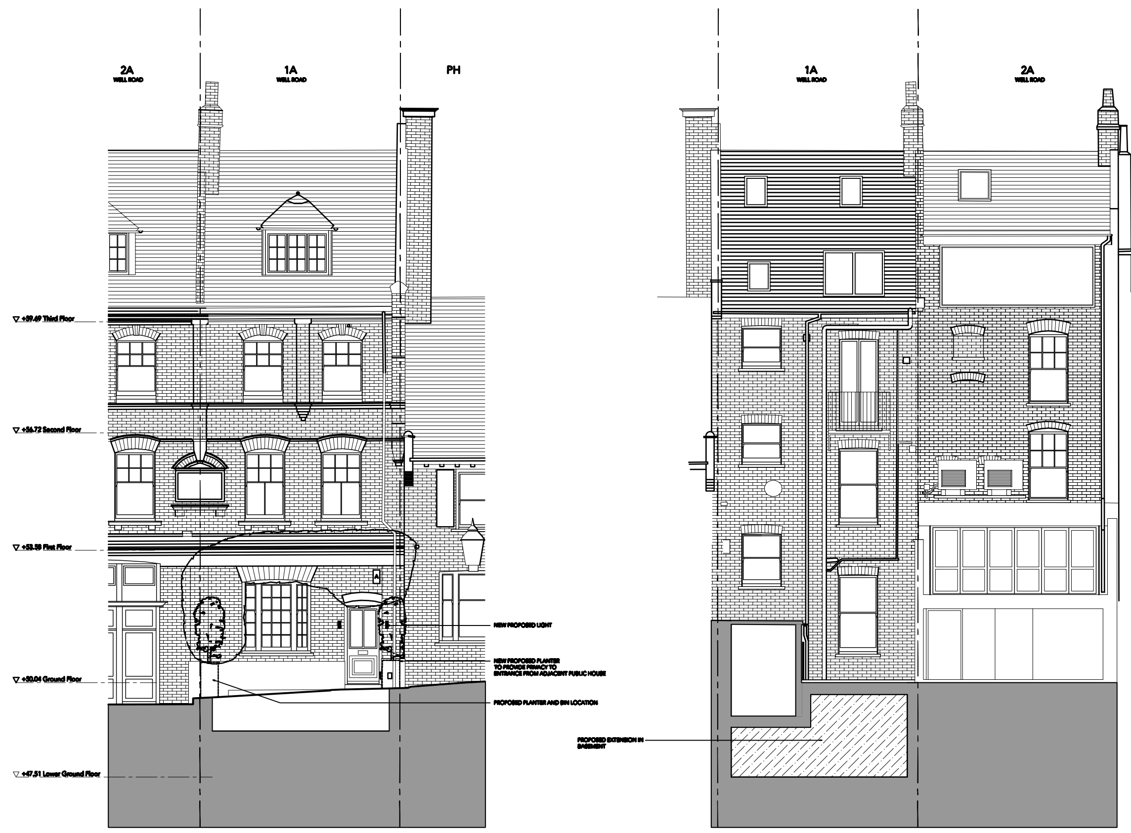
1 Proposed Front Elevation scale 1:50