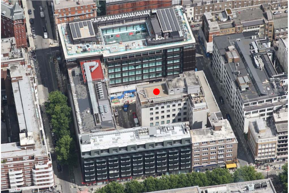
West View – with Tottenham Court Road at the bottom