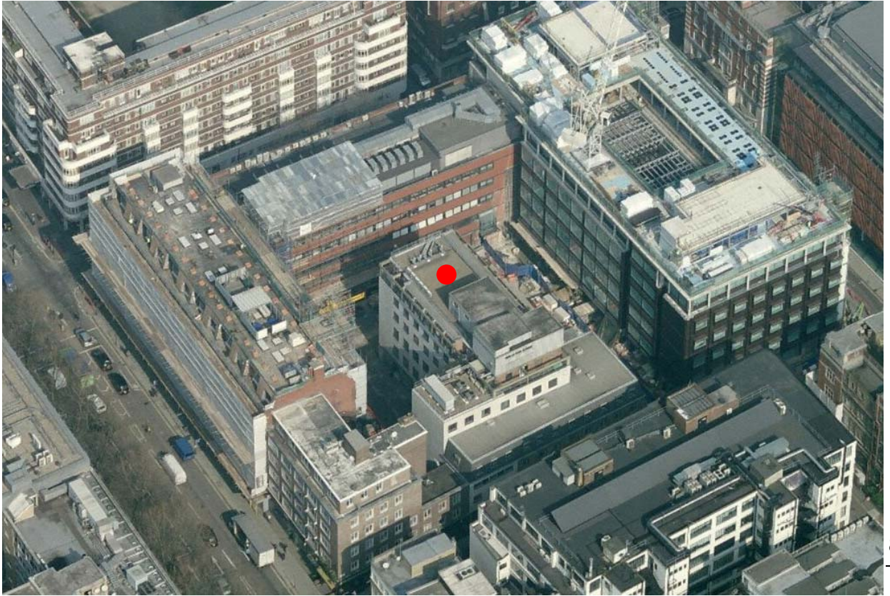
South West View –