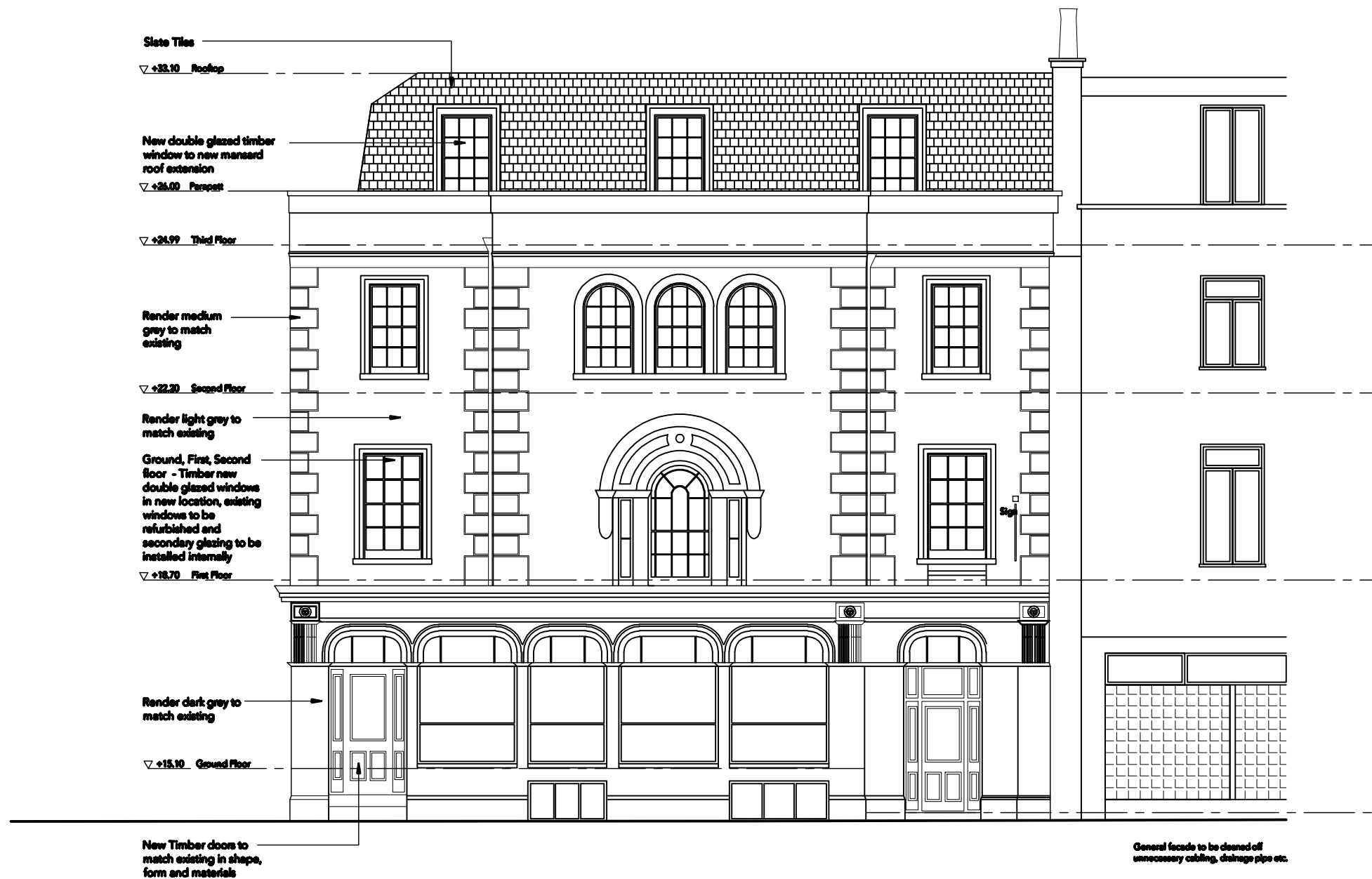
1 Proposed North Elevation scale 1:100

PLANNING APPLICATION A - TITLE BLOCK & SCALE AMENDED 21.10.2013 06.11.2013