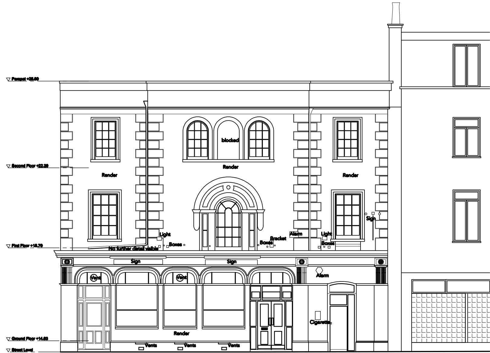
1 Existing North Elevation scale 1:100

PLANNING APPLICATION A - TITLE BLOCK & SCALE AMENDED 21.10.2013 06.11.2013