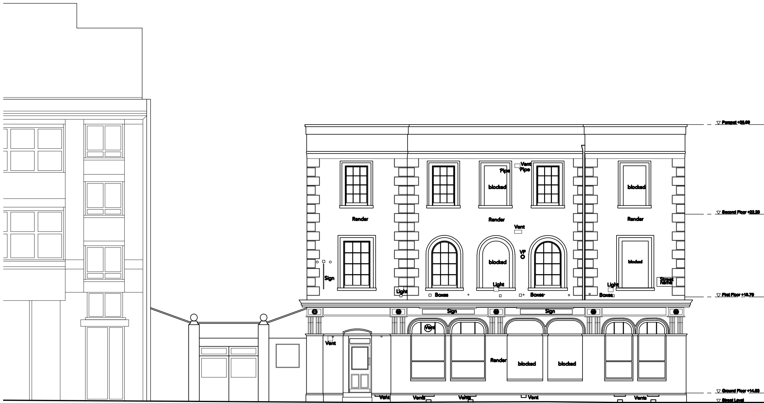
1 Existing South Elevation scale 1:100

PLANNING APPLICATION A - TITLE BLOCK & SCALE AMENDED 21.10.2013 06.11.2013