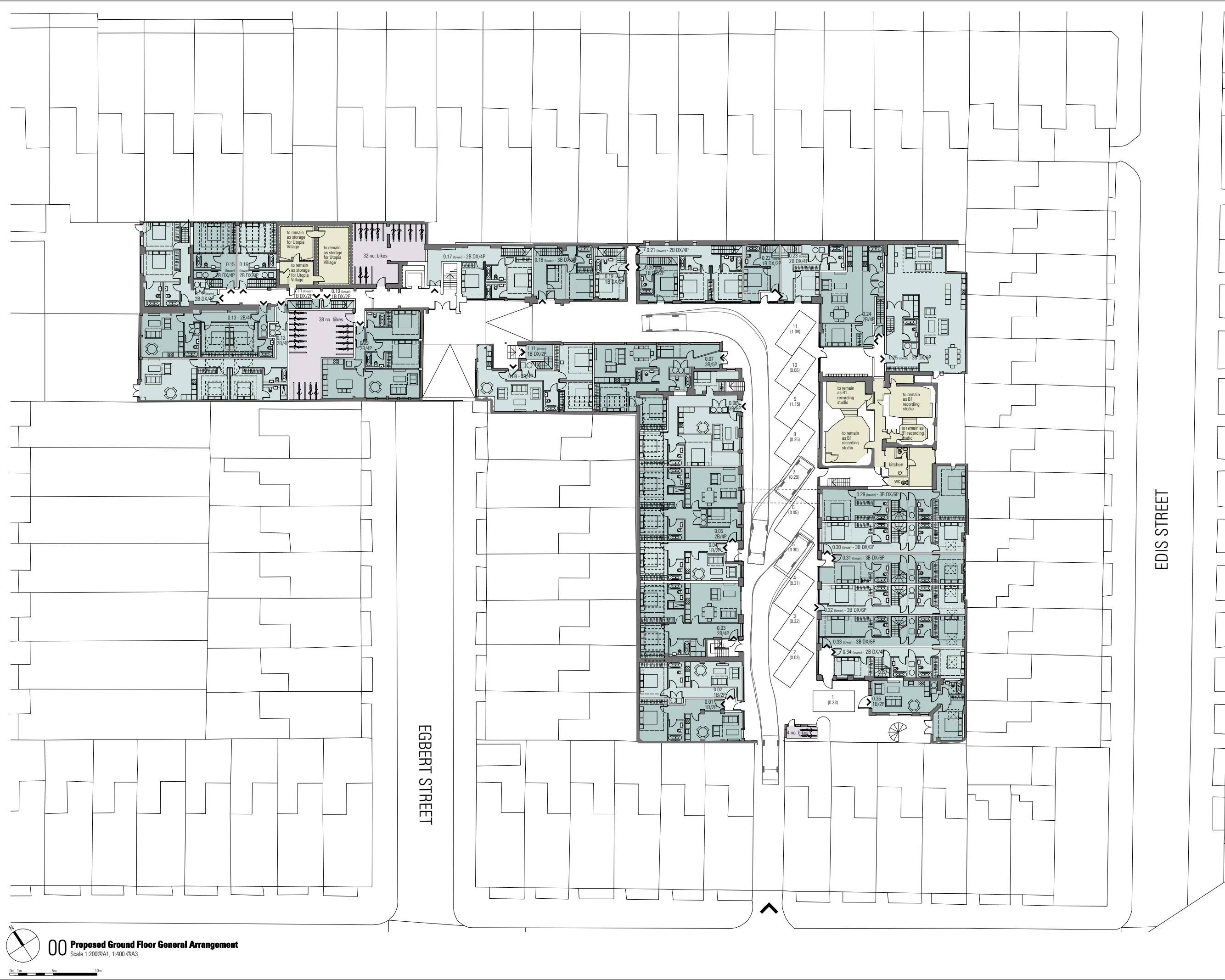
00 Proposed Ground Floor General Arrangement Scale 1:200 @ A1, 1:400 @ A3